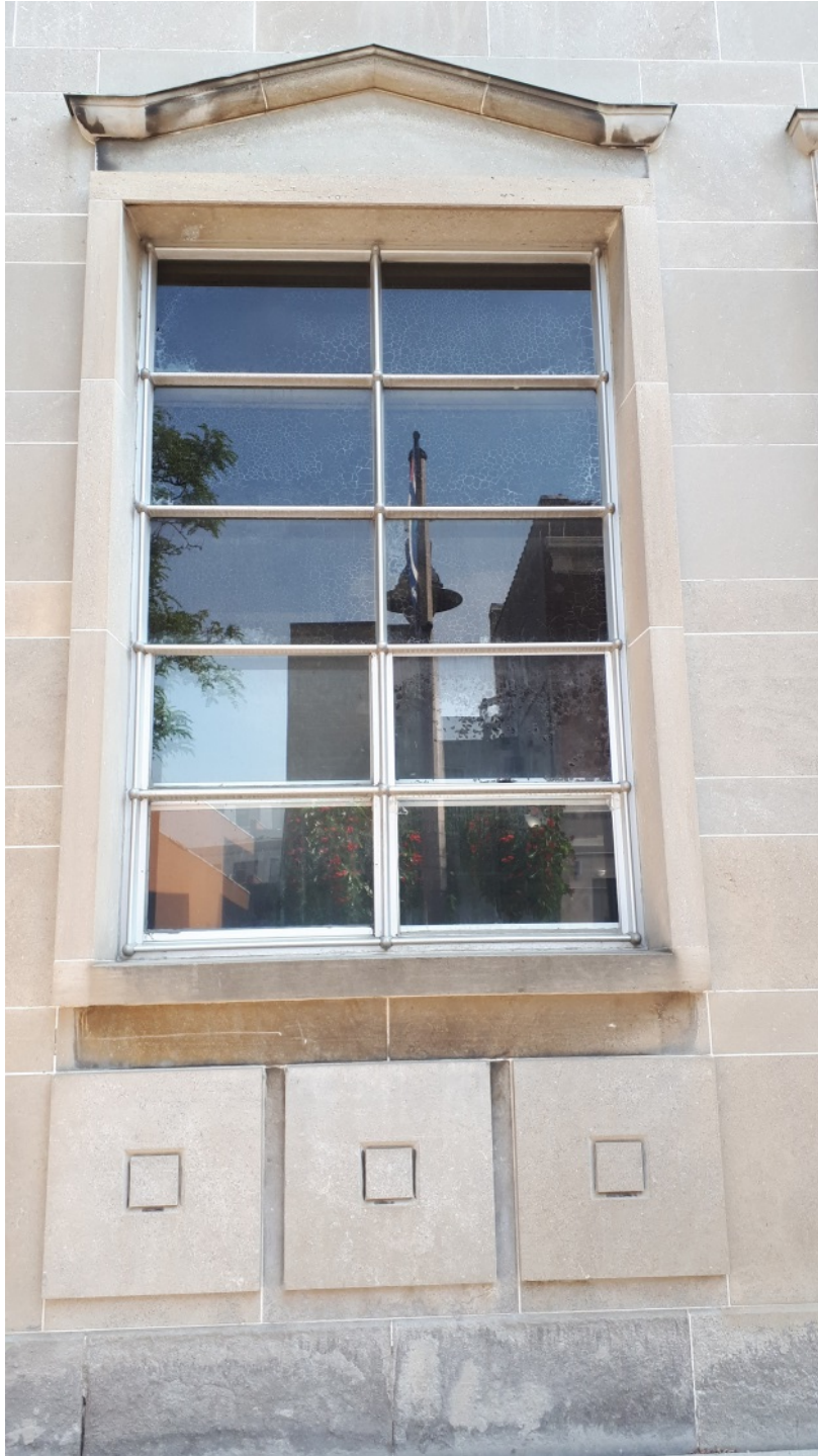
Figure 11 - Oshawa Federal Building and Post Office, first floor window opening with hood mould above and geometric pattern below each window. June 2019