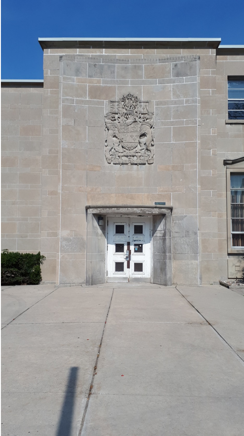
Figure 12 - Oshawa Federal Building and Post Office, main entrance, west façade, with a crest of the Royal Coat of Arms of Canada above the doorway. June 2019