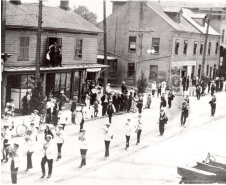
Figure 3 - Oshawa Railway car barns at the corner of Simcoe Street South and Athol Street East, where the former Oshawa Federal Building and Post Office currently stands. circa 1915.

According to the 1948 Fire Insurance Map there was no structure on the northern portion of the lot. The lot appeared to be a parking lot until it was purchased by the Federal Government in 1950 to erect a federal building, which would contain the post office, customs offices and other government departments.