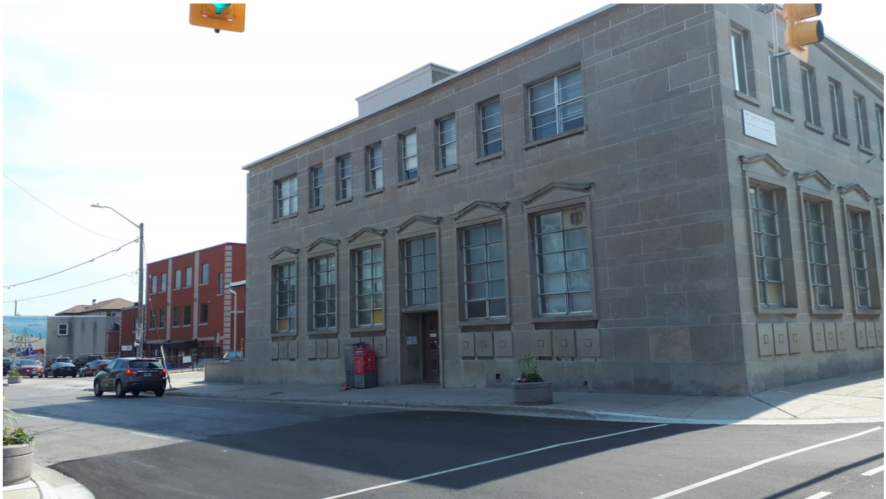
Figure 9 - Oshawa Federal Building and Post Office, east façade. June 2019