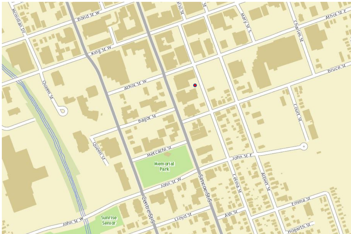
Figure 2 – Location of 47 Simcoe Street South, Oshawa. The red dot indicates the location of the former Oshawa Federal Building and Post Office. City of Oshawa GIS Map June 2019

Constructed in 1953, the property at 47 Simcoe Street South is located on the southeast corner of Simcoe Street South and Athol Street East, bounded by Celina Street to the east, and 57 Simcoe Street South to the south. Located within Downtown Oshawa, the former Oshawa Federal Building and Post Office's frontage is 41.45 metres (136 ft.) on Simcoe Street South and 29.26 metres (96 ft.) on Athol Street East, filling the majority of the area of the site (see Figure 2).