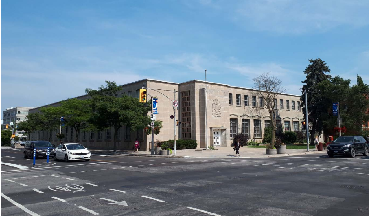
Figure 1 - Oshawa Federal Building and Post Office, June 2019