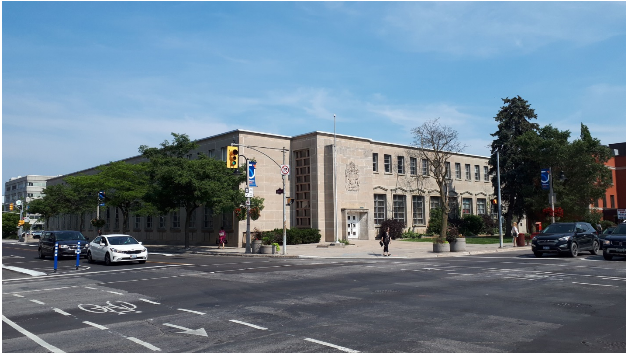
Figure 5 - Oshawa Federal Building and Post Office, northwest façade. June 2019