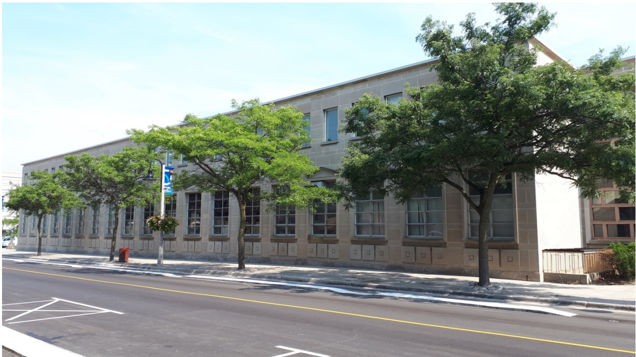
Figure 6 - Oshawa Federal Building and Post Office, north façade. June 2019