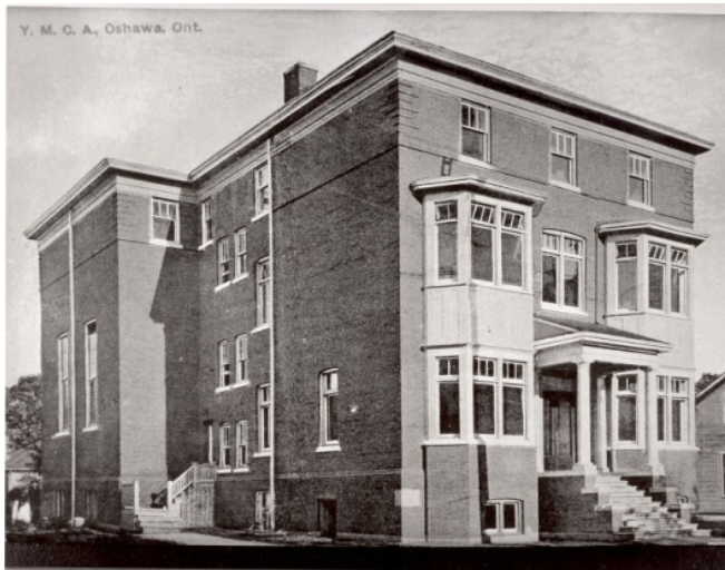
Figure 3 - YMCA Building, Oshawa, circa 1912.

The YMCA was once located on the lot that is now occupied by the south half of the former Oshawa Federal Building and Post Office (see Figure 4). This YMCA building was torn down to make room for the new Oshawa Federal Building and Post Office.