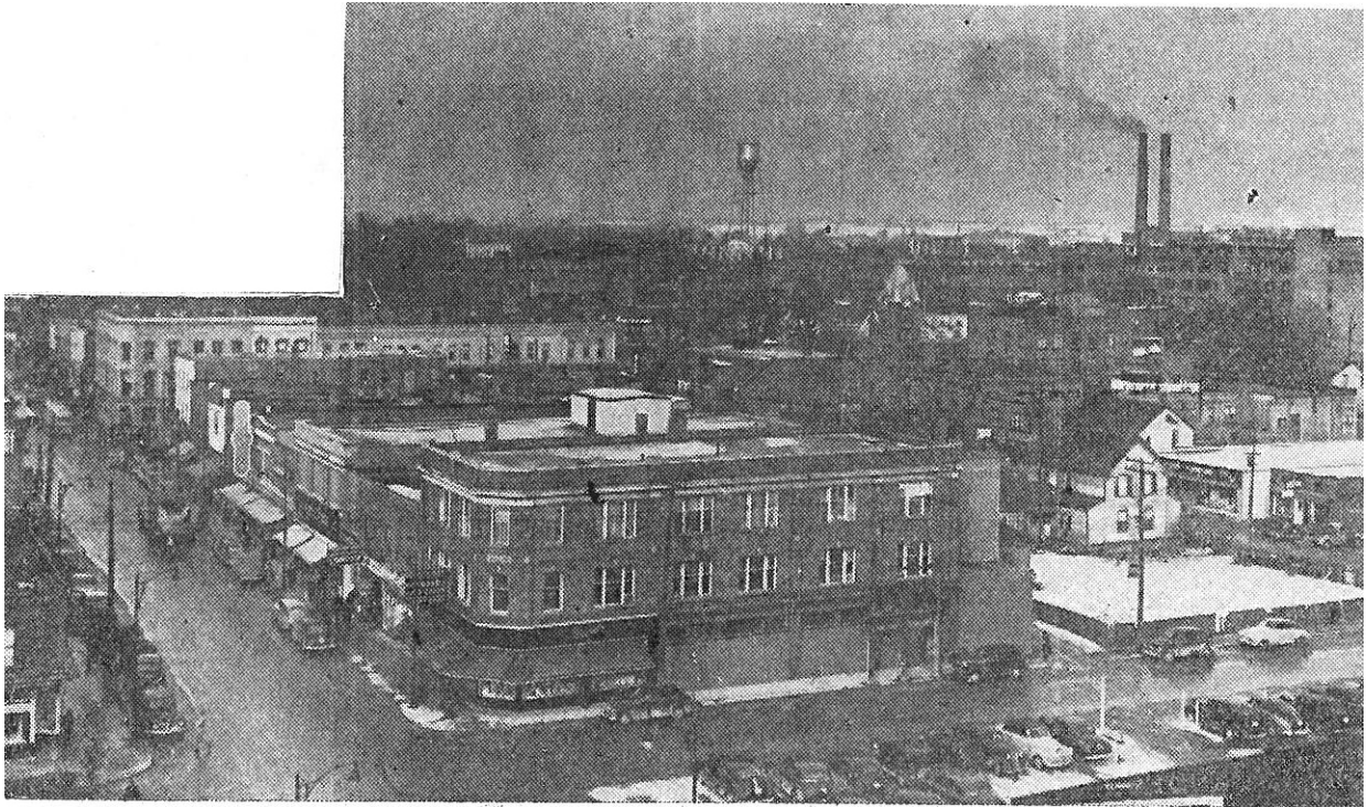
Simcoe Street, looking North from Athol Street and site of new Post Office and Government Building.