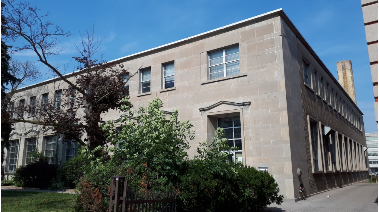
Figure 8 - Oshawa Federal Building and Post Office, south façade. June 2019