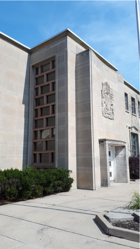
Figure 10 - Oshawa Federal Building and Post Office, main entranceway. June 2019