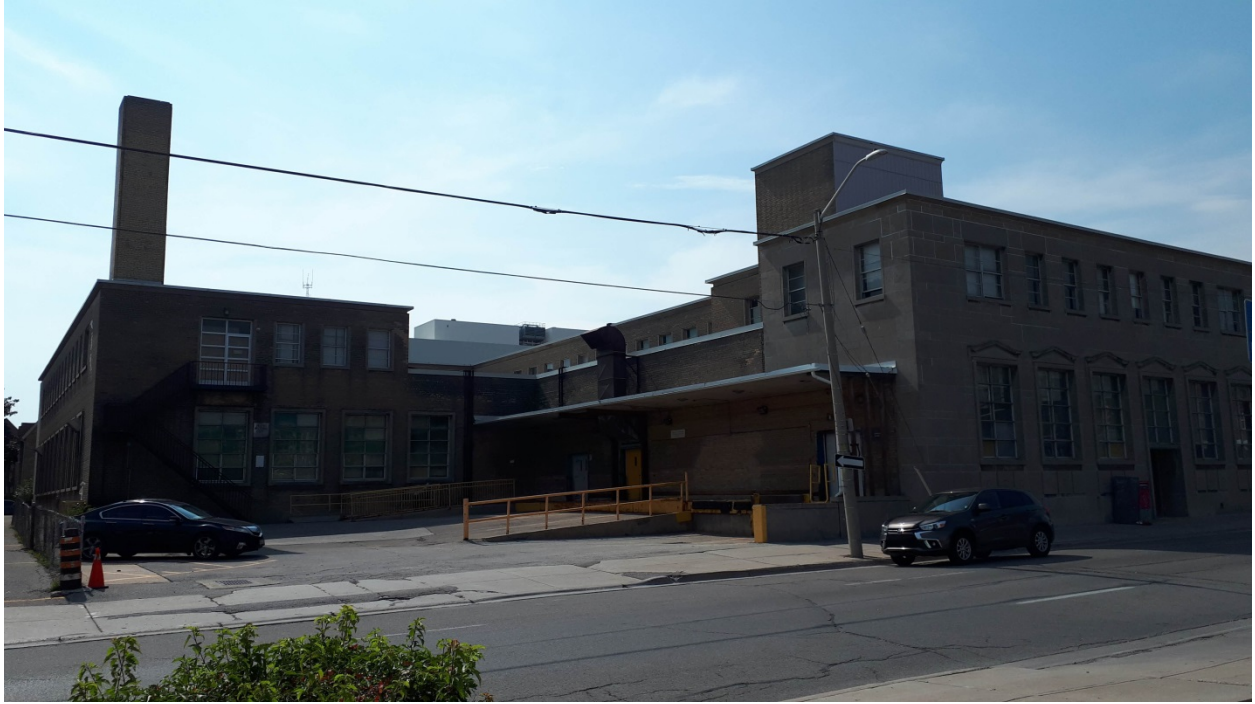
Figure 7 - Oshawa Federal Building and Post Office, southeast façade. June 2019