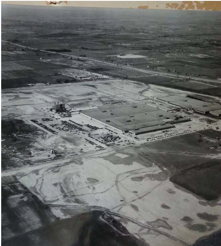
Figure 29 - This photo shows the construction of the expansion of the General Motors of Canada South Plant, Chassis Plant. Facing northwest. Circa 1952.