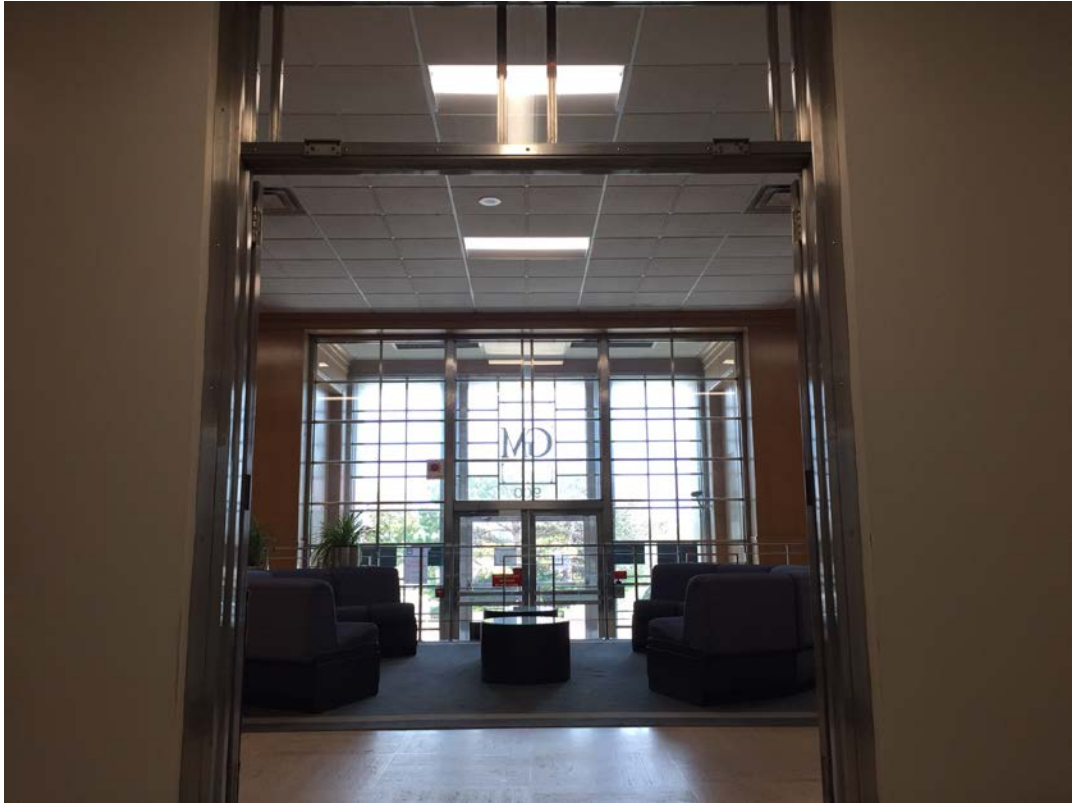
Figure 23 - 900 Park Road South, lobby interior looking east, stainless door frames and transom (on west wall).