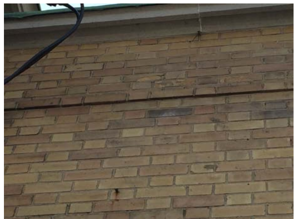
Figure 10 – (left) 700 Park Road South employee entrance, central section, east façade; (right) Detail of string course, cornice, and copper flashing.