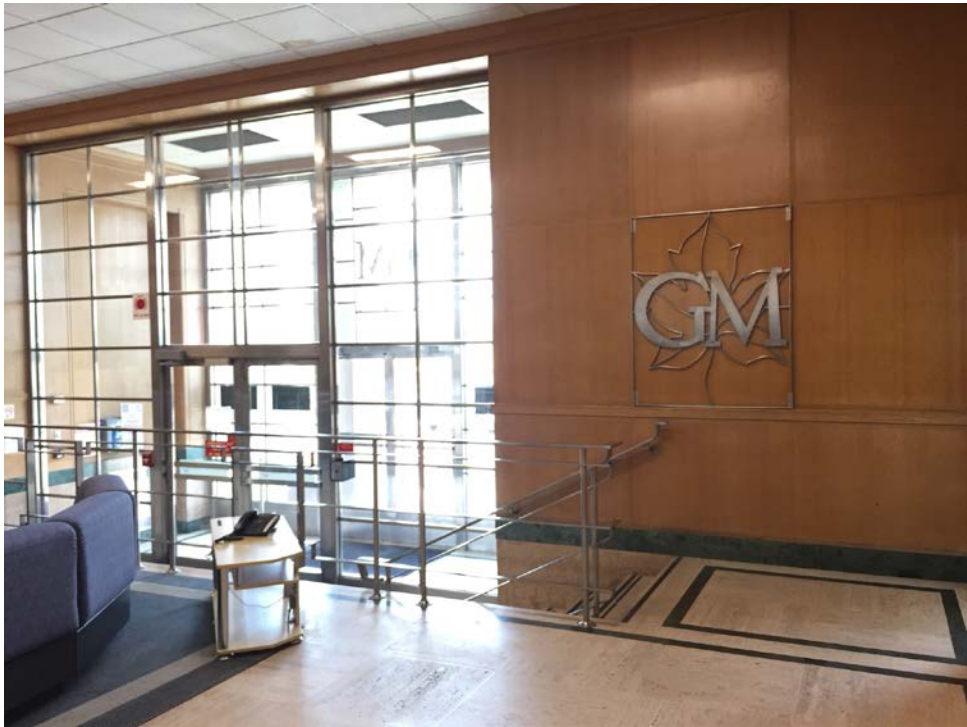
Figure 22 - 900 Park Road South, lobby interior, showing entry and stainless steel GM sculpture (east wall).