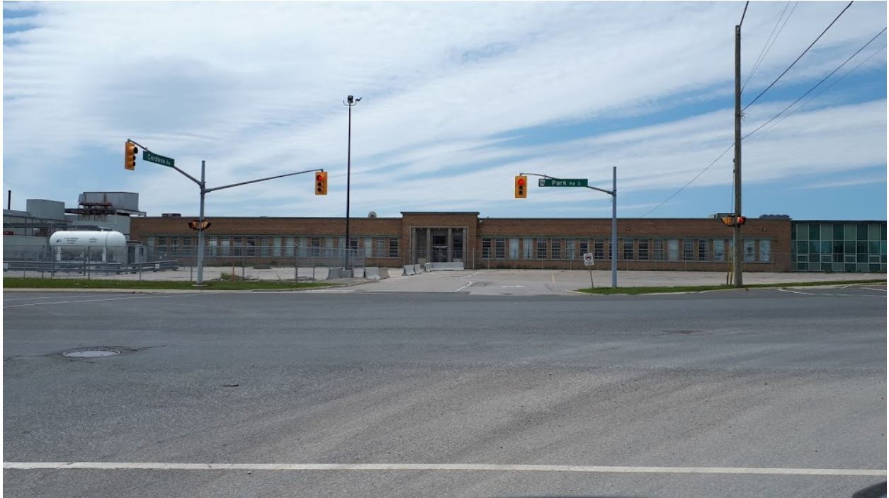
Figure 4 - From Cordova Avenue, east façade of 700 Park Road South