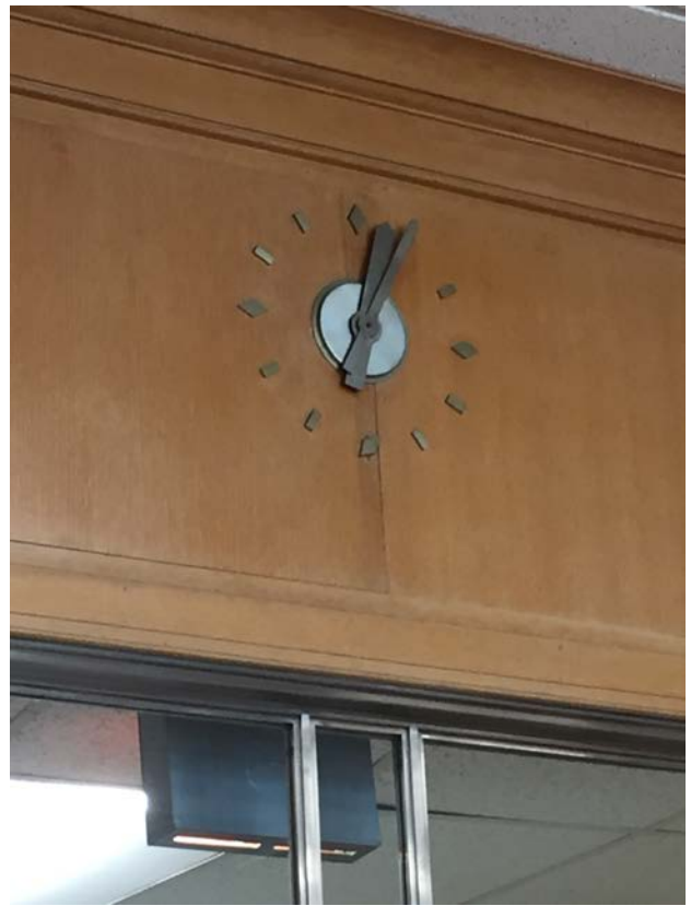
Figure 20 - 900 Park Road South lobby interior, showing birch panelling and original clock (west wall).