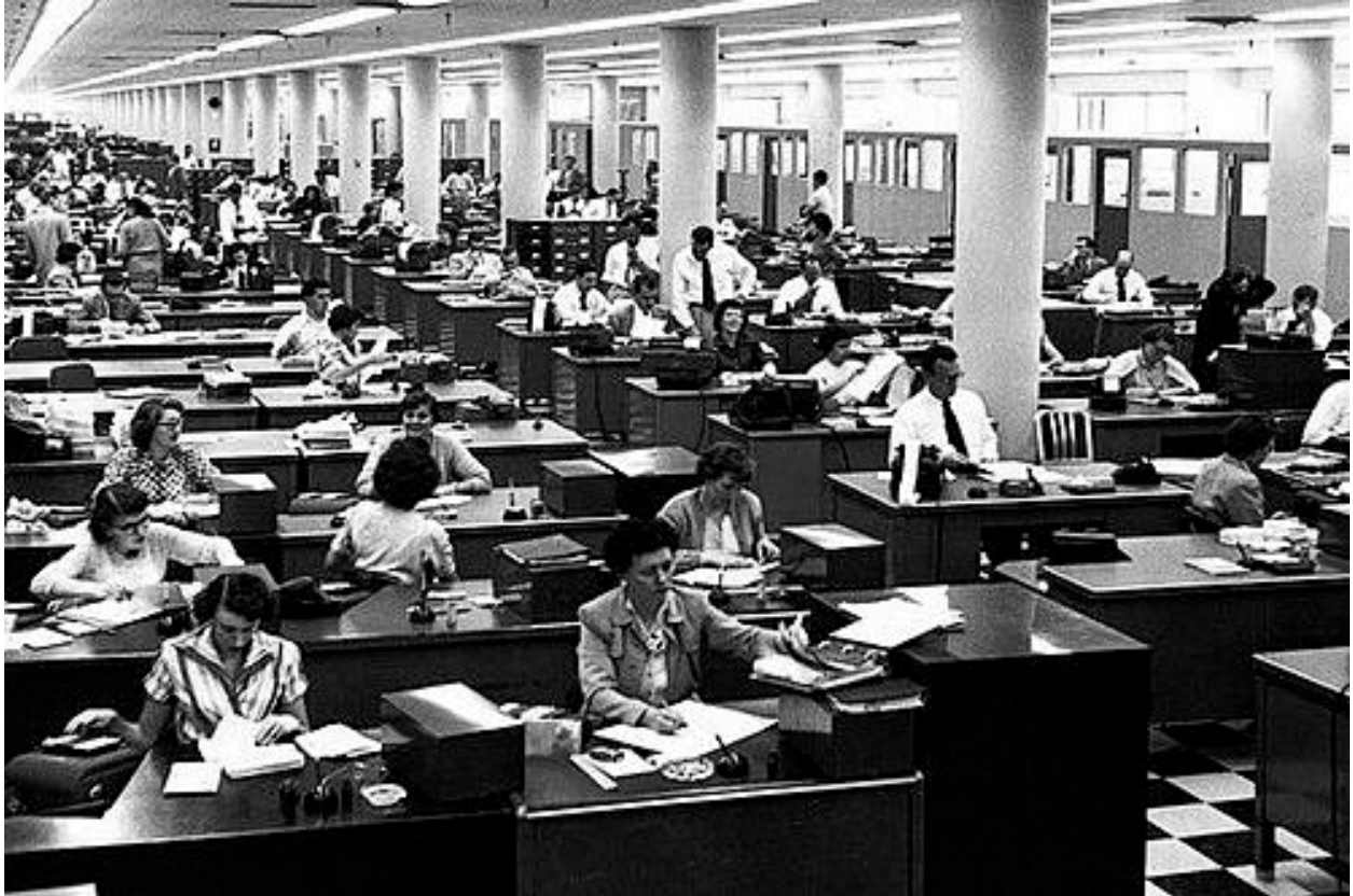
Figure 11 – Example of 1950s interior office layout, similar to 700 Park Rd South.