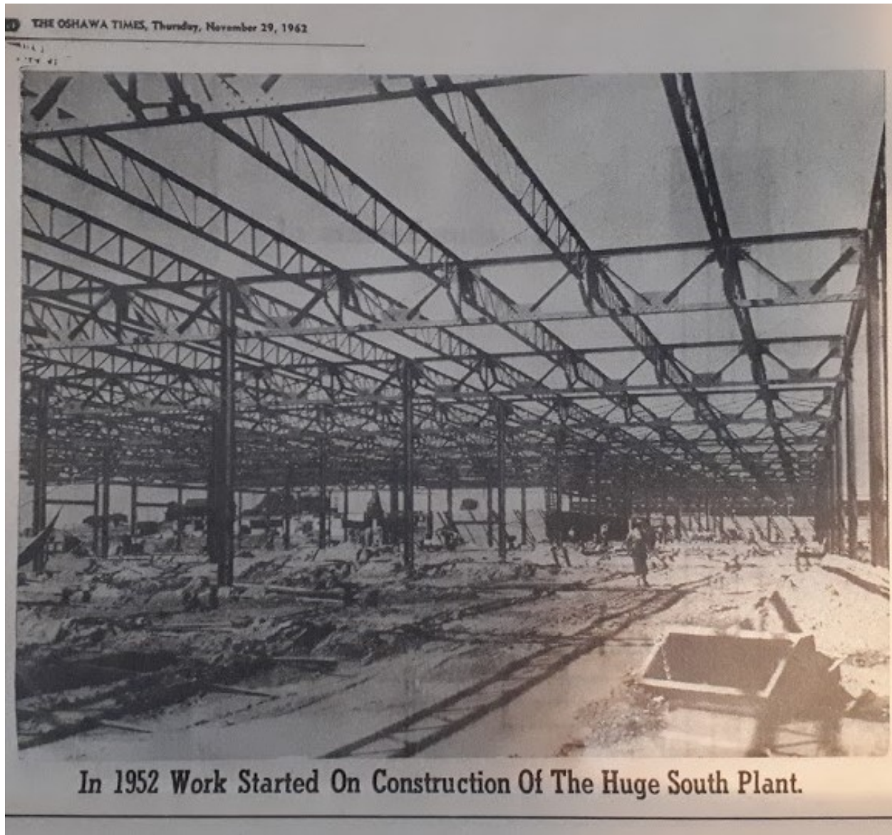
Figure 27 - Picture from the Oshawa Times showing construction of the GM South Plant in 1952