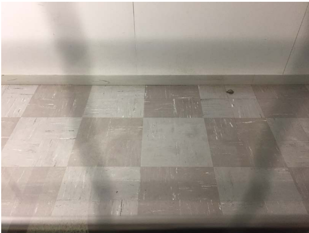
Figure 26 – 900 Park Road South second floor, showing striae vinyl tiles in checkered pattern.