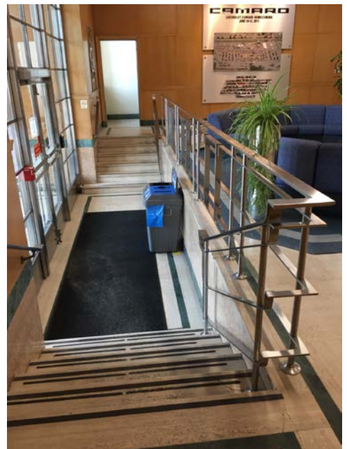
Figure 18 - 900 Park Road South, lobby interior, showing the stainless steel railing and double stairs.