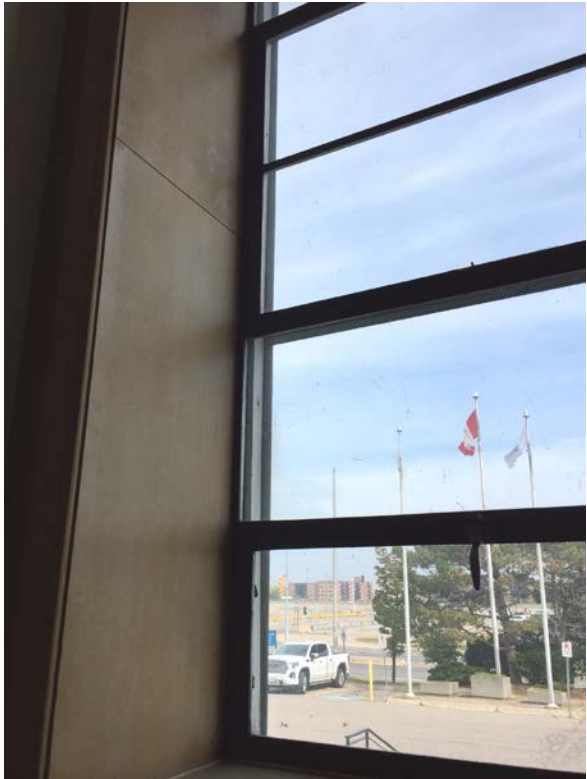
Figure 24 - 900 Park Road South south stairwell window, showing stainless window frames and birch panelling surrounds (front/east wall).