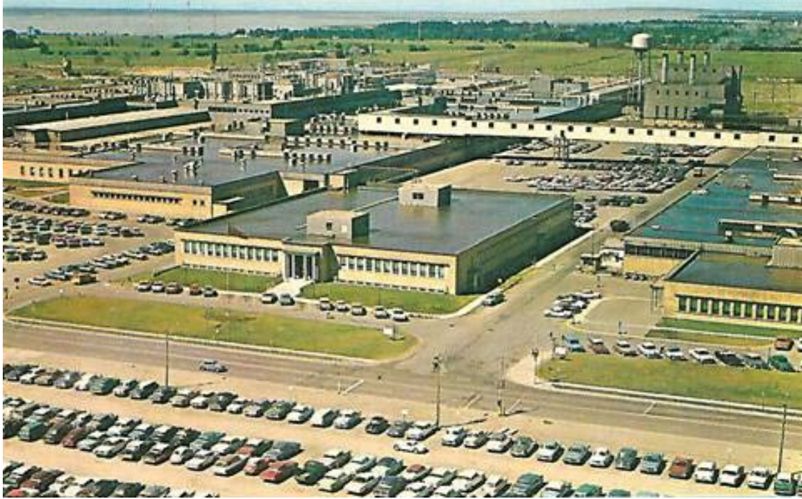
Figure 28 - Postcard showing the GM South Plant, Oshawa. Facing southeast. Date unknown.