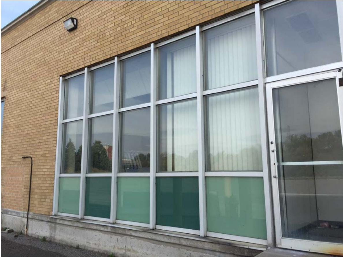
Figure 9 - 700 Park Road South, close-up view of windows and coloured glass panels at employee entrance, north façade