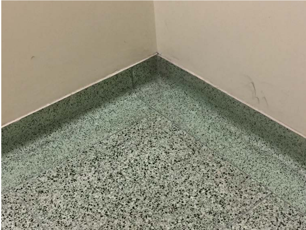
Figure 25 – 900 Park Road South, terrazzo flooring and cove “baseboard” trim in south stairwell.