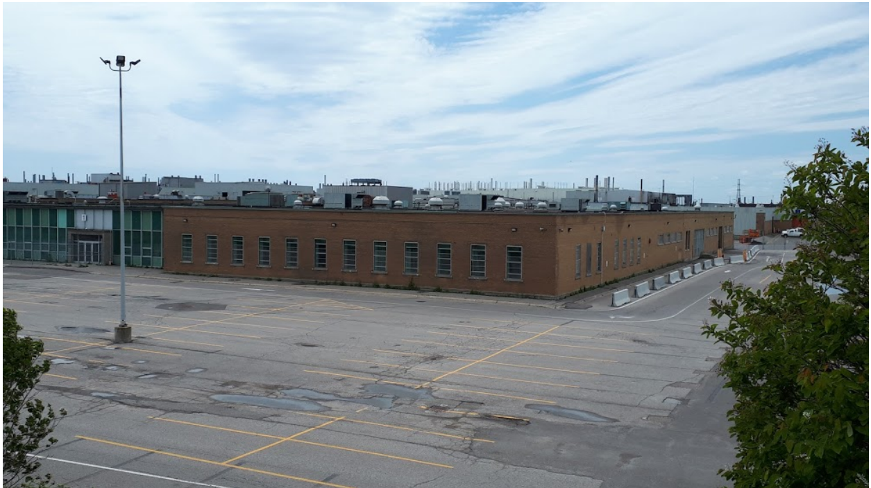
Figure 5 - 700 Park Road South, northeast façade