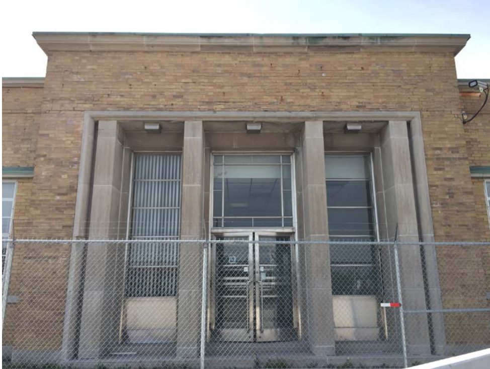
Figure 6 - 700 Park Road South main entrance, east façade. Note carved cement cornice with copper flashing and four piers framing the entry.