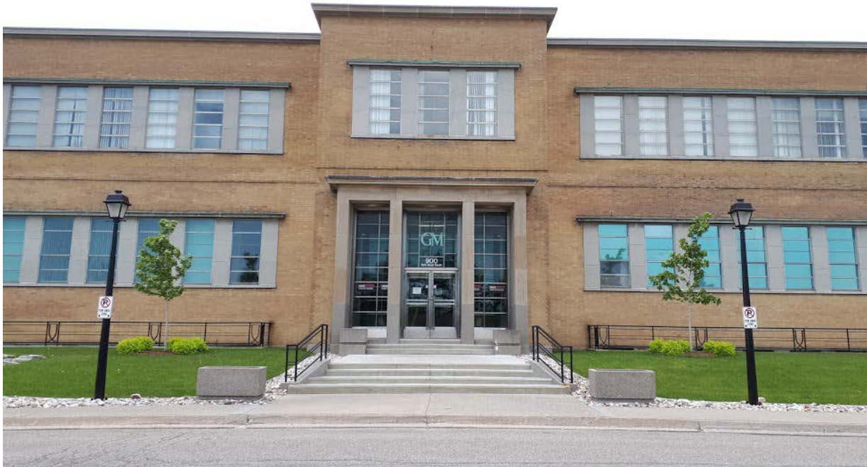
Figure 1 - 900 Park Road South