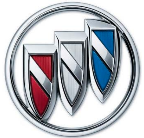
Figure 7 - 900 Park Road South, showing iron railing around east façade with stylized shield motif (left), perhaps reflecting the Buick emblem (right).