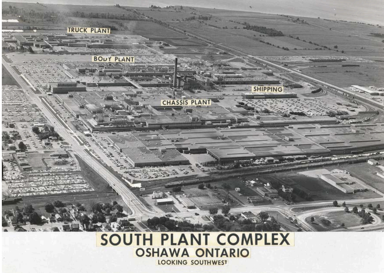
Figure 30 - Aerial view of the General Motors South Plant complex looking southwest. Circa late 1960s. Photo 2374c, courtesy Thomas Bouckley Collection, Robert McLaughlin Gallery.