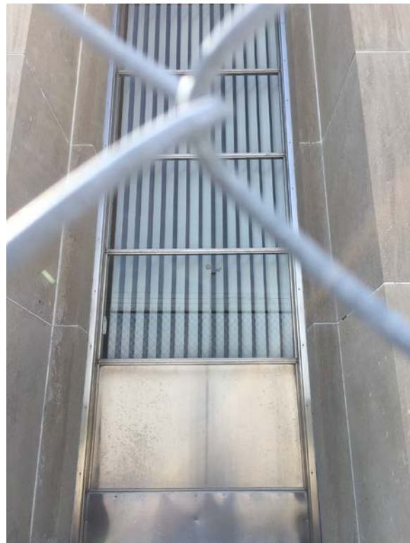
Figure 8 - 700 Park Road South, close-up view of of main entrance with stainless doors and transom (left); and (right) window to left of door with stainless framing and lower panel.