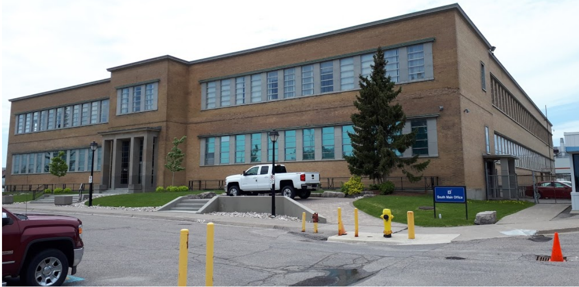
Figure 15 - 900 Park Road South, northeast façade.