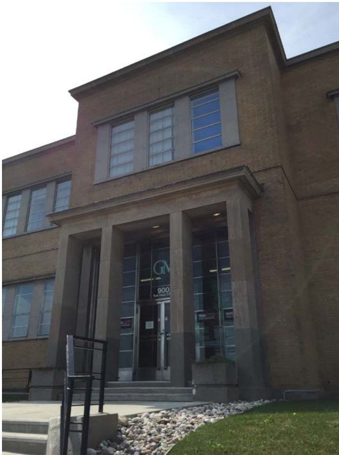
Figure 16 – South Main Office front entry, 900 Park Road South. Note the similar projecting frontispiece supported by four piers.