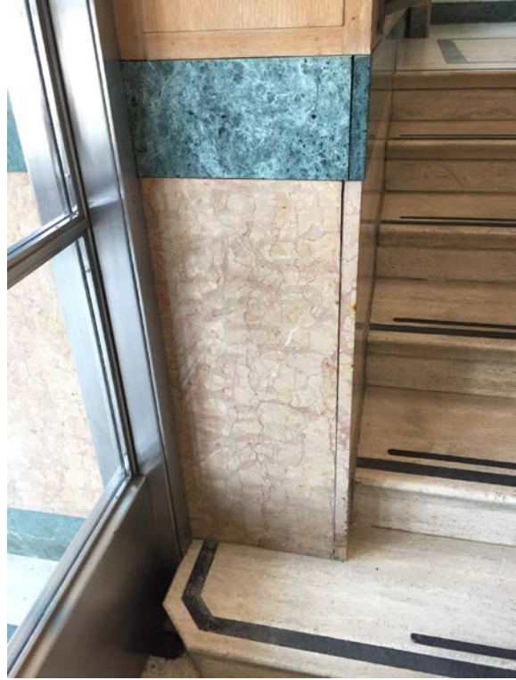
Figure 19 - 900 Park Road South lobby interior, showing the stainless steel railing, double stairs, and green trim and insets.