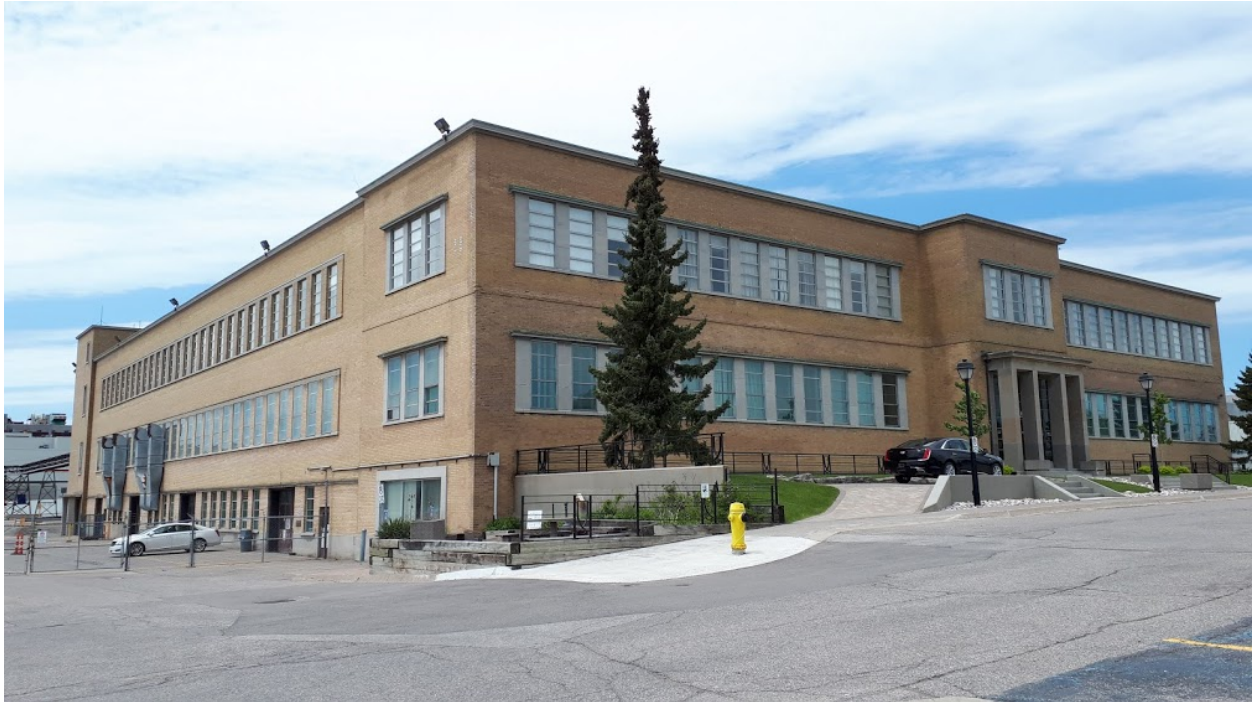
Figure 14 - 900 Park Road South, South Main Office, southeast façade