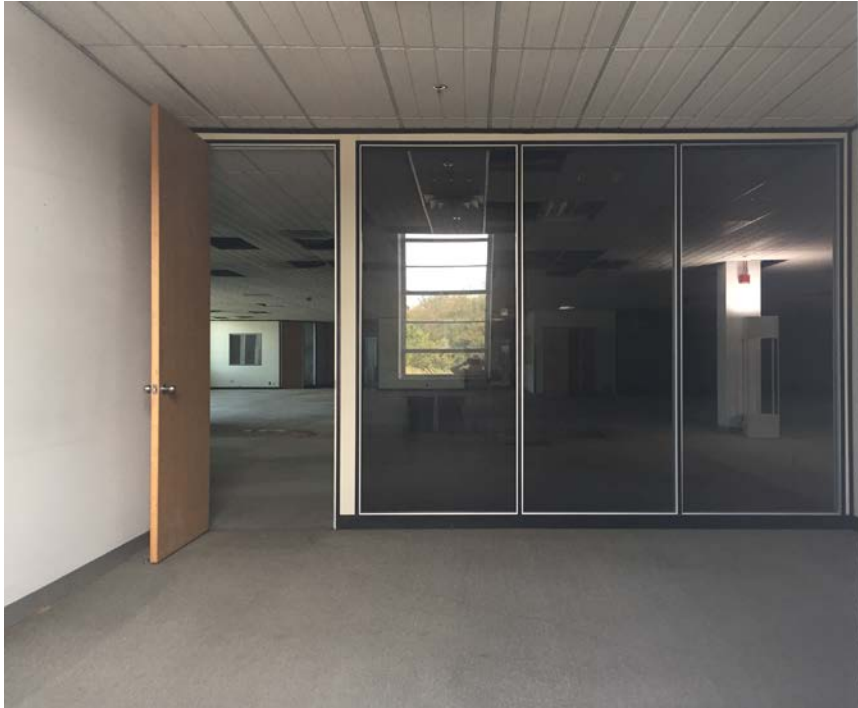
Figure 12 - 700 Park Road South, view of manager's office and open area beyond.