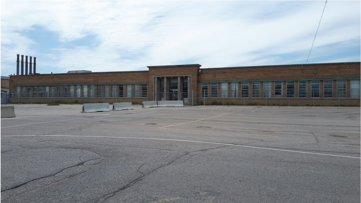
Figure 2 - 700 Park Road South, east façade