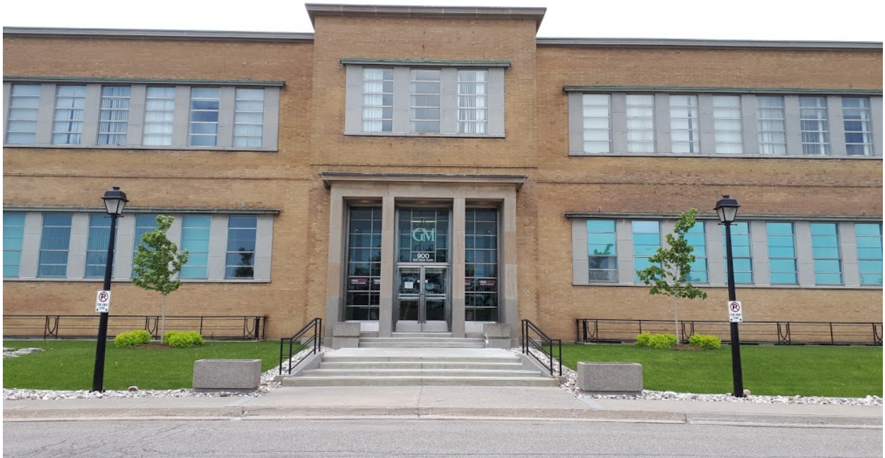
Figure 13 - 900 Park Road South, South Main Office, east façade