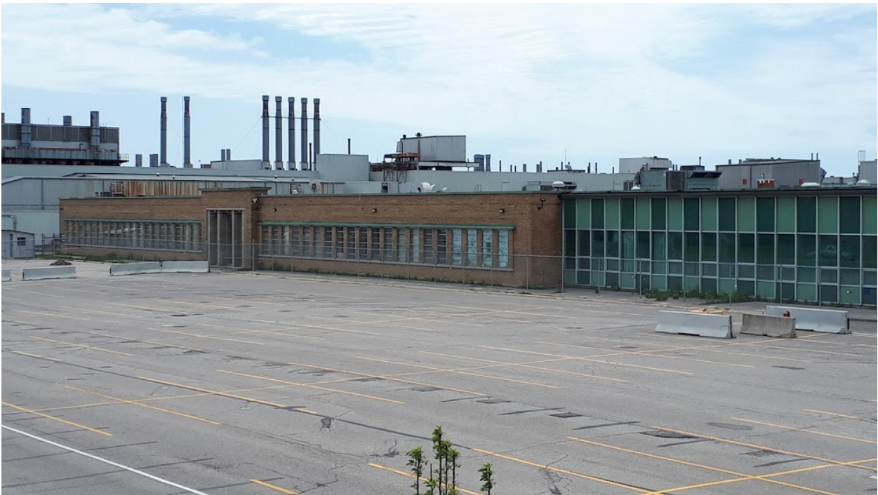
Figure 3 - East façade of 700 Park Road South, showing part of the central addition to the north.