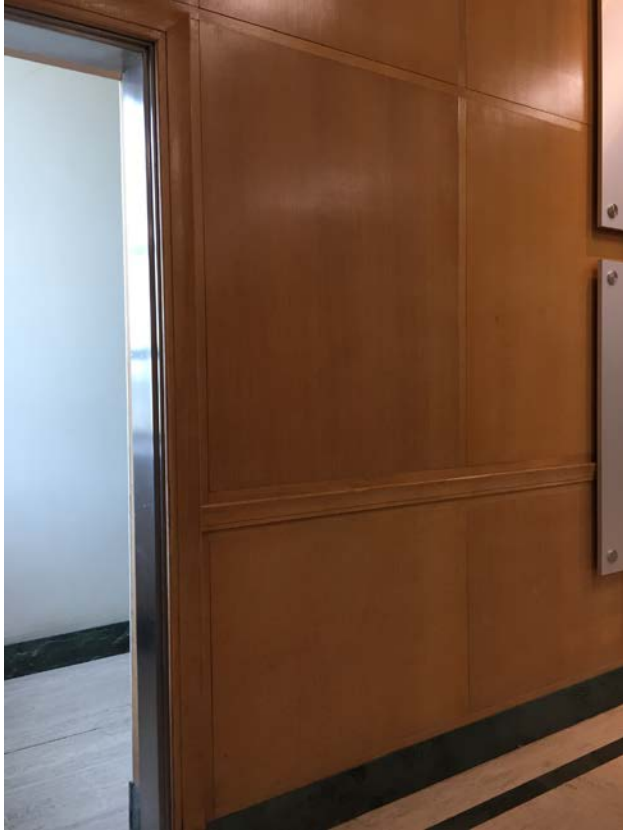
Figure 21 - 900 Park Road South lobby interior, showing birch panelling and trim, stainless door jambs, chair rail, stone floors and green stone trim & baseboards (south wall and stairwell beyond).