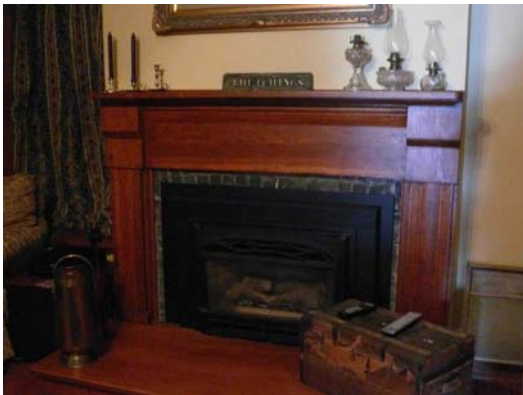
Fireplace Mantel and stone work – Original to the home (gas insert was added at a later date)