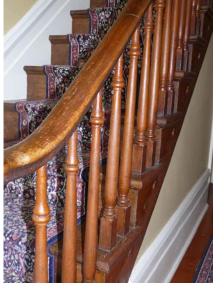
Stair case – Original to the home