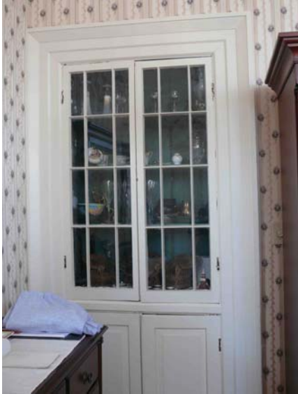
Built in Cupboard – Original to the home