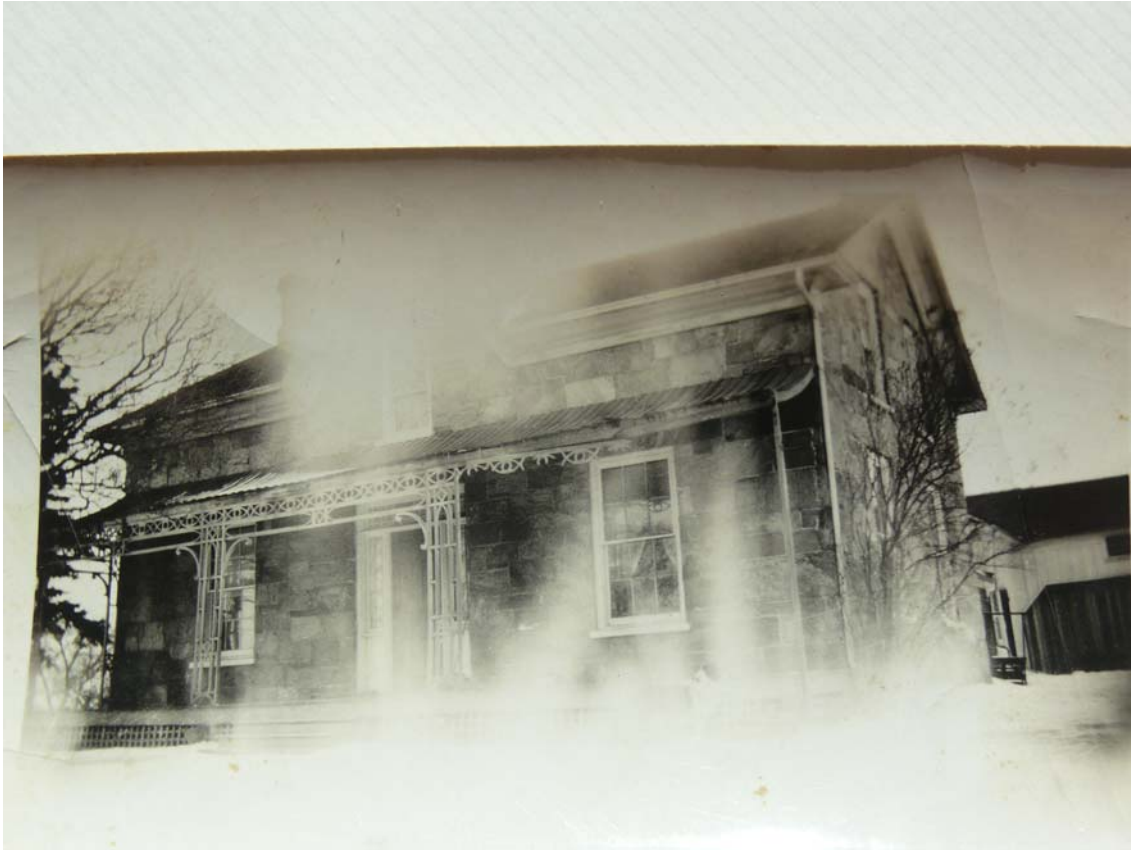
1395 Winchester Road East, circa 1930 – The north extension can be seen in this photograph. The porch has been removed from the front of the home.