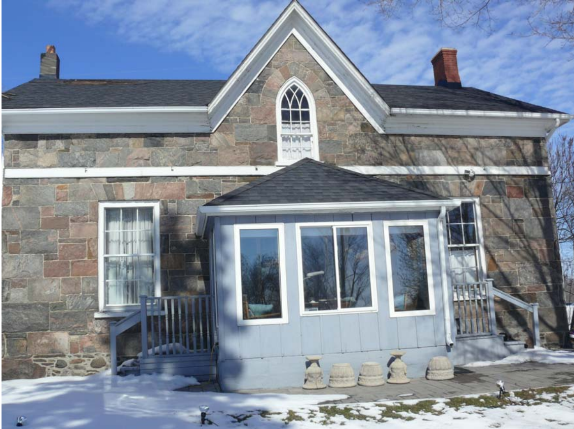
1396 Winchester Road East, South Façade - February 2008