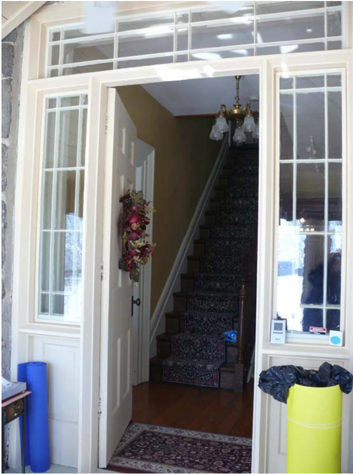
1396 Winchester Road East, Entranceway - February 2008

1396 Winchester Road East, East Façade