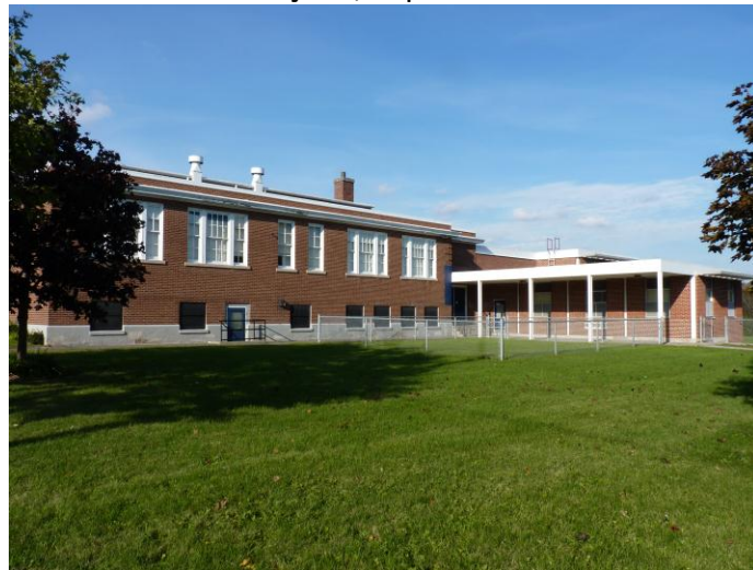
South Façade, September 2012