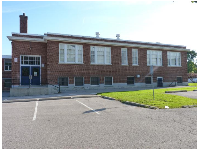
North Façade, September 2012