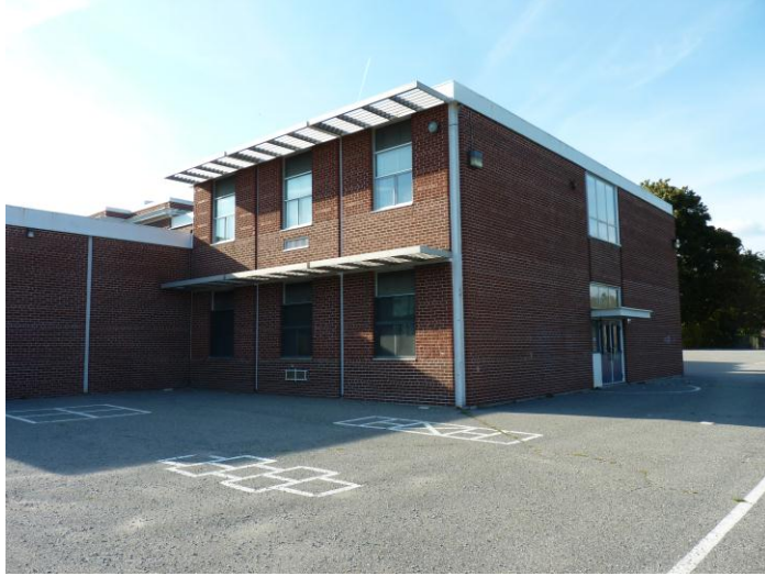
East Façade, September 2012