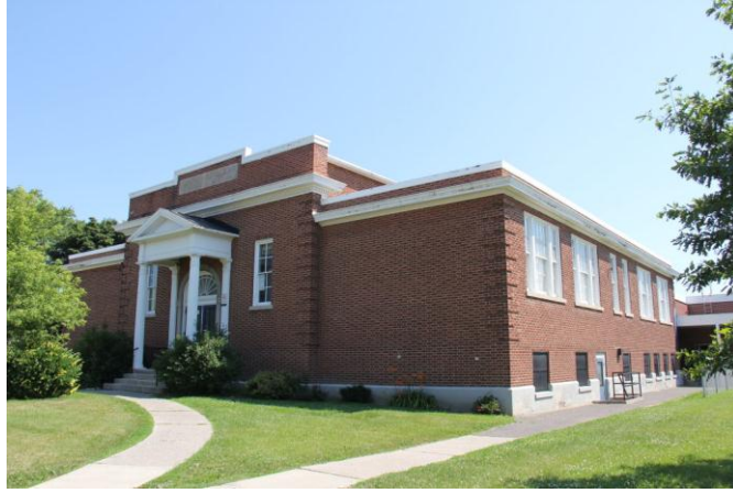
West Façade, September 2012