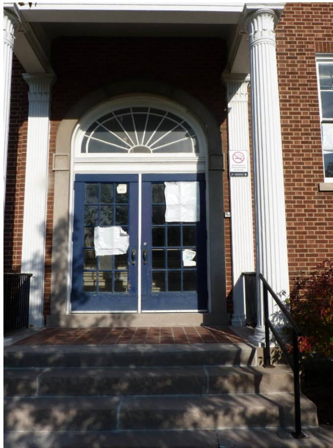
West Façade, Entranceway, September 2012