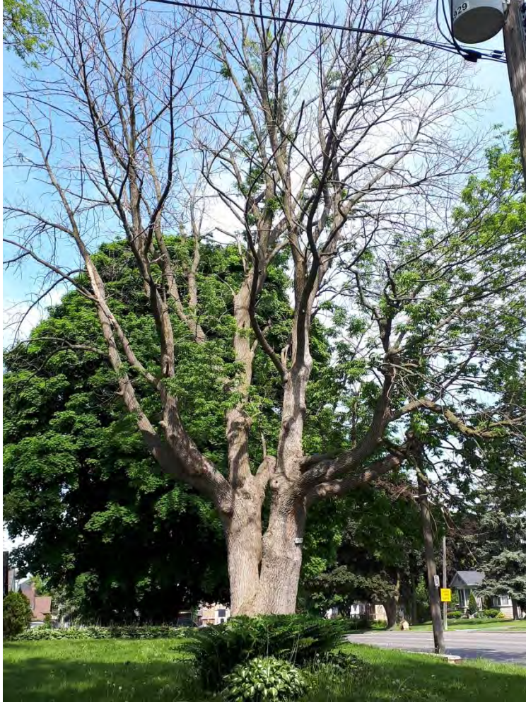
7. 494 King Street East, Ash Tree possibly affected by the EAB, Mature Vegetation