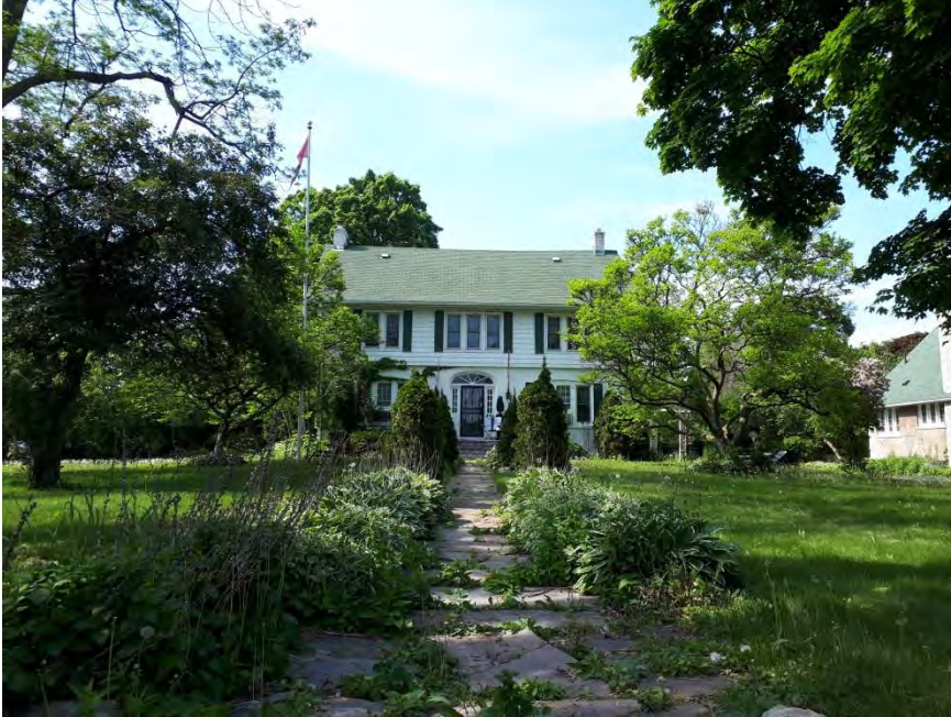
1. 494 King Street East, Front Façade, South Elevation