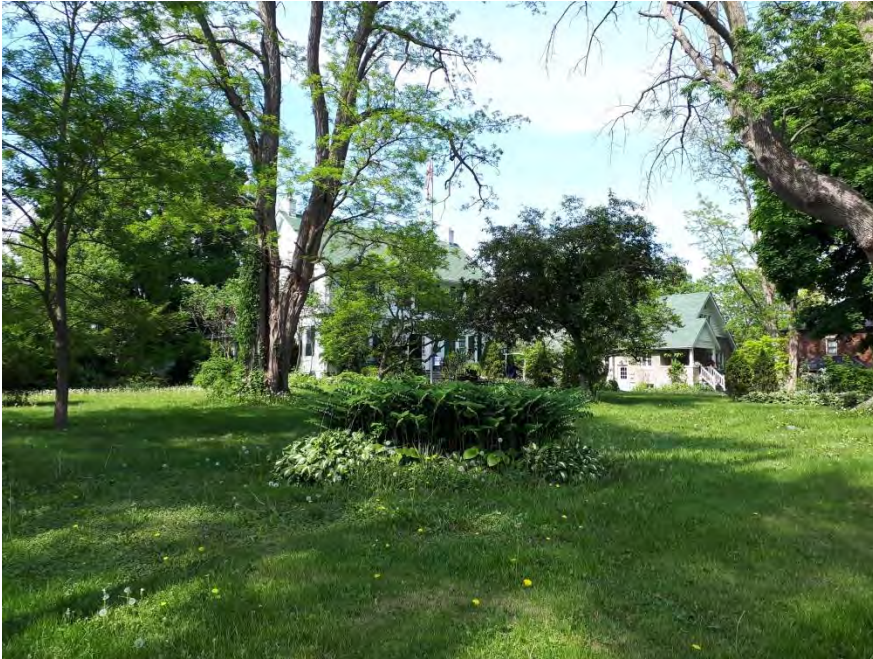
5. 494 King Street East, South West view of the Property, Mature Vegetation