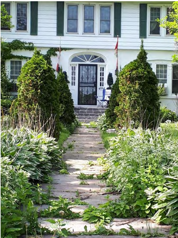
4. 494 King Street East, Front Door Case