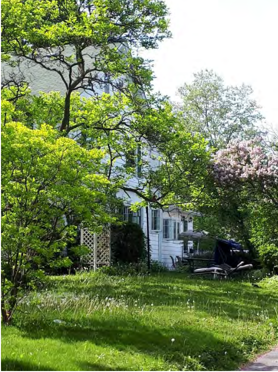
3. 494 King Street East, East Elevation (difficult to see due to overgrowth of vegetation)