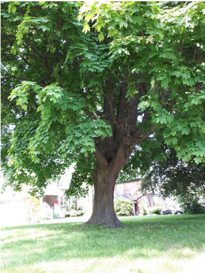
6. 494 King Street East, Mature Vegetation, Maple Tree, approximately 150 years old