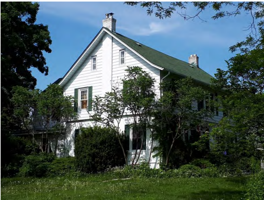
2. 494 King Street East, West Elevation