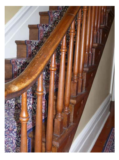
Stair case - Original to the home