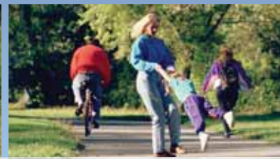
Oshawa Creek Trail