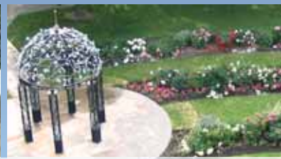
Oshawa Valley Botanical Gardens