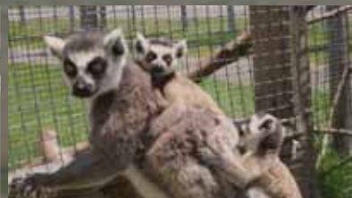
Oshawa Zoo & Fun Farm