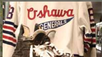
Oshawa Sports Hall of Fame