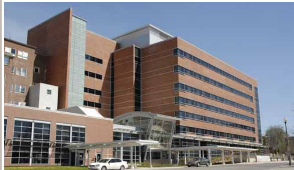
Lakeridge Health Oshawa continues to invest in health care excellence and has recently constructed the Durham Regional Cancer Centre, new dialysis unit and LHEARN centre.