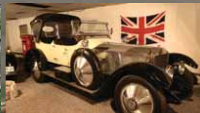
Canadian Automotive Museum