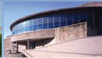
Robert McLaughlin Gallery