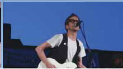
Local Band - Cuff The Duke

2009 OLYMPIC TORCH RELAY · 2010 ACTIFEST ONTARIO SENIOR GAMES · 2011 CANADIAN OPEN CURLING · 2015 PAN-AMERICAN GAMES