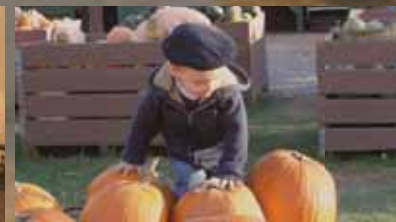
Linton's Vegetable Farm