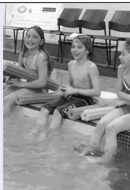
Teaching Children's Safety.

This program is possible through a grant, supported by the Ontario Ministry of Education, the Ontario Ministry of Health Promotion, the Stephanie Gaetz KEEPSAFE Foundation and the Lifesaving Society Foundation.