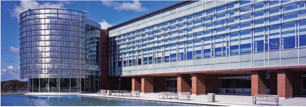
The University of Ontario Institute of Technology is well-known for its leading-edge laptop-based learning environment and state-of-the-art buildings. The university's library is designed by the award-winning firm of Diamond and Schmitt Architects Inc. (2006)