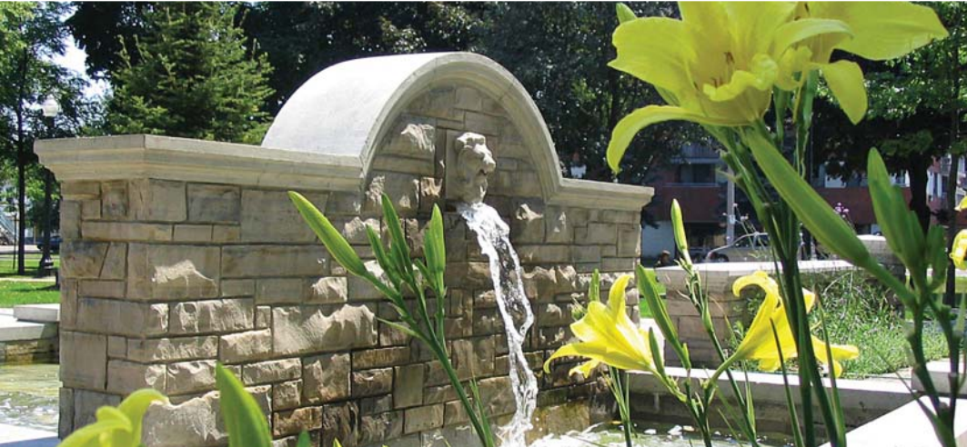
Memorial Park located in downtown Oshawa is home to many events including free concerts in the park at the McLaughlin band shell. (2004)