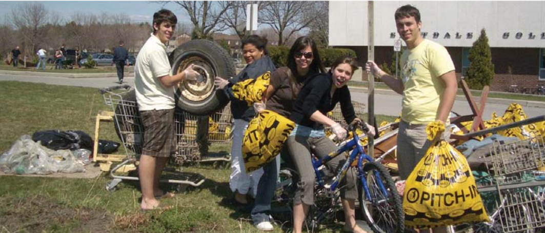
In 2007, 216 community groups contributed over 34,000 volunteer hours as part of PITCH-IN to clean up 269 sites. Fifty-nine schools recruited 15,059 student volunteers, including Eastdale Collegiate High School who had over 1,600 students participate. (2007)