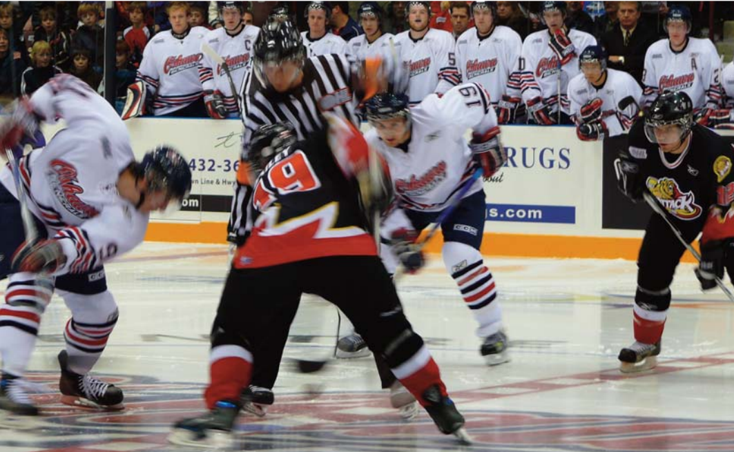
The Junior A Oshawa Generals Hockey Club is an active community contributor and its players serve as youth role models visiting schools and hospitals and participating in fundraising events. Public school groups are also featured at home games by singing Canada's national anthem. (2006)