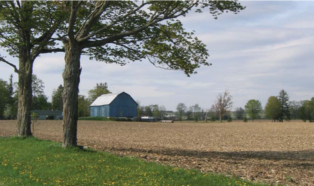
The City's scenic, natural hamlets of Columbus and Raglan are surrounded by rich agricultural lands. Oshawa is comprised of 43% rural lands. (1999)