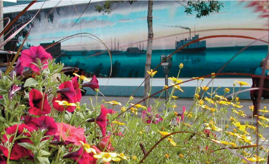
The city has 19 murals which reflect Oshawa's rich history. The On the Lake Mural illustrates the Argyle passenger/freight steamer that docked at the Oshawa harbour in the early 1900s. (2001)