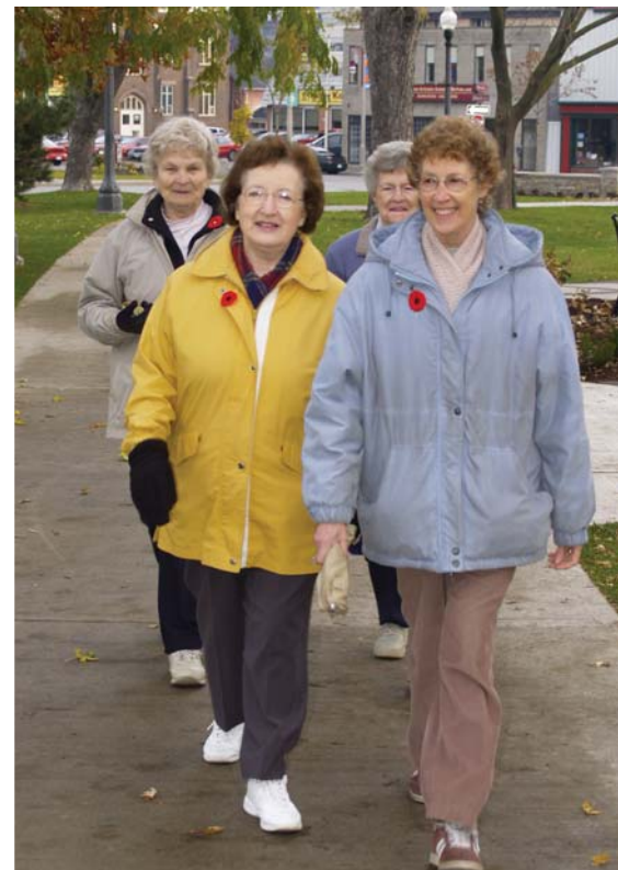
The Oshawa Senior Citizens Centres and 10 community partners launched the Ready, Set, Action! Program that includes garden, heritage and nature walks. (2006)

The OSCC are non-profit, multi-purpose community facilities for adults 55+. Three branches provide programs and services for independent living, recreation and advocacy. A strong volunteer network assists with programs and services. In 2006, more than 400 volunteers provided over 44,000 hours of support and 100,000 seniors participated in recreation programs. To ensure active participation, transportation and meals are provided.