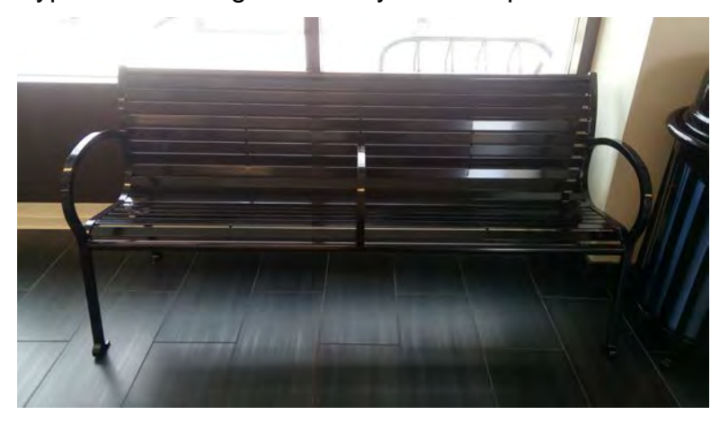
Type: Scarborough Series by Landscape Forms