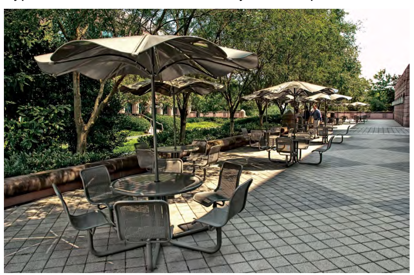
Type: Carousel / Solstice Series by Landscape Forms