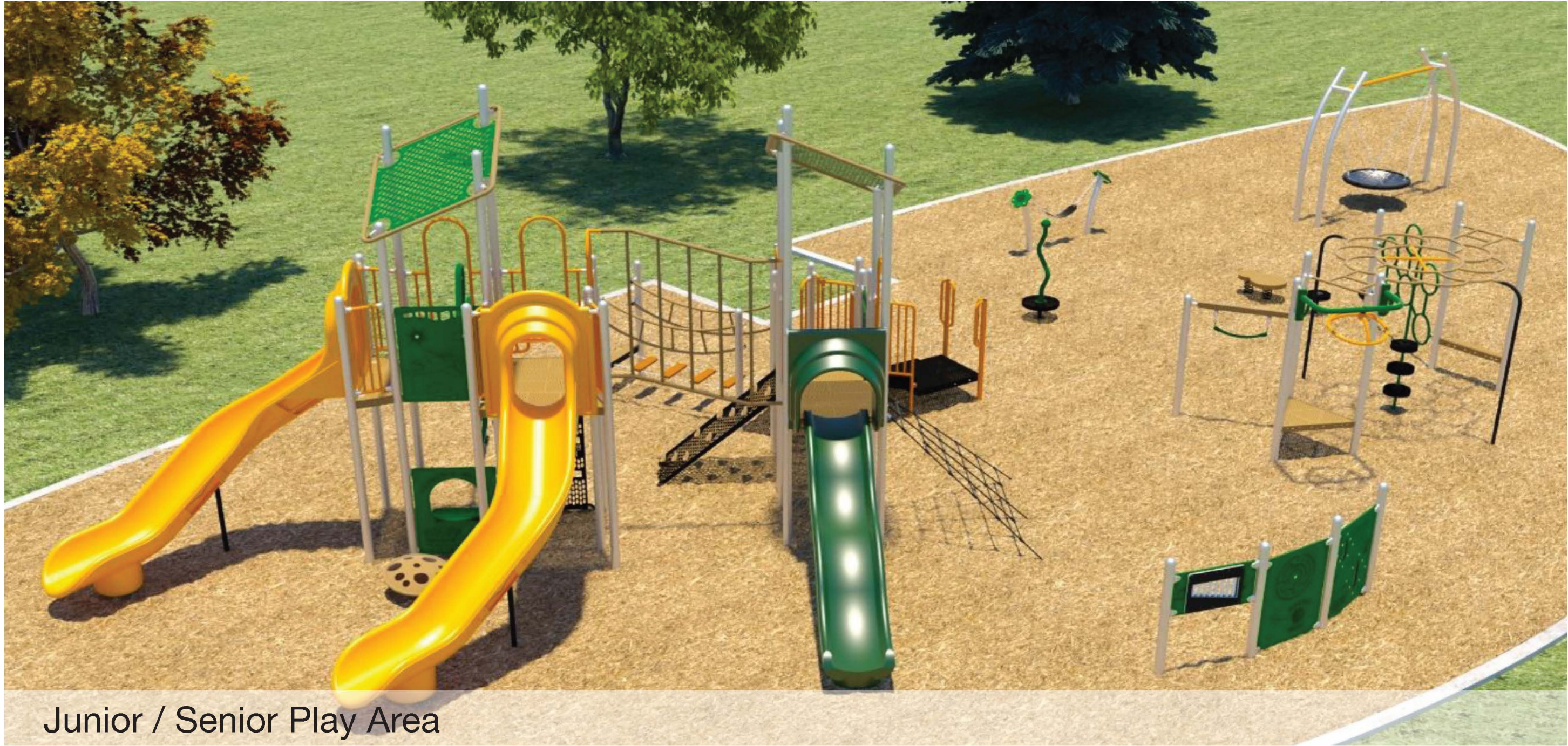
Junior / Senior Play Area