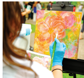
Above and left photo by: Oh Canada Photography