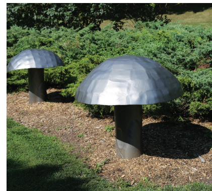
Mushrooms by St. Stephen's Catholic Secondary School Oshawa Valley Botanical Gardens Collection: City of Oshawa