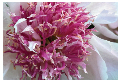
Above photo: Daniella Paudash