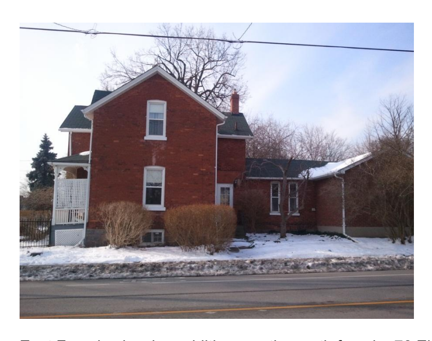
East Façade showing additions on the north facade, 76 Elgin Street East, January 2013