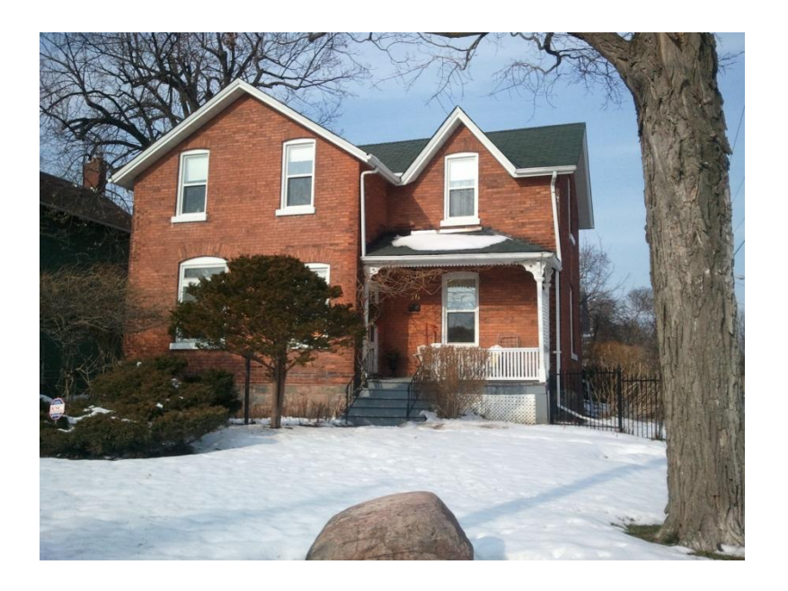
South Façade, 76 Elgin Street East, January 2013