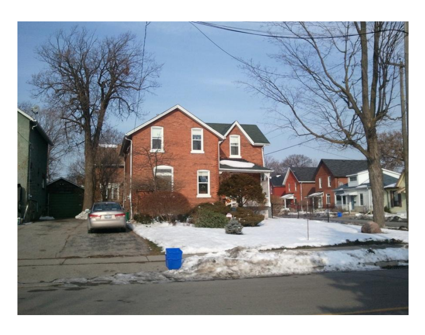
Main Façade, South Façade, 76 Elgin Street East, January 2013