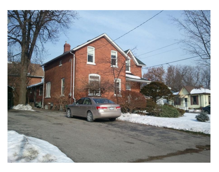
Southwest Façade, 76 Elgin Street East, January 2013