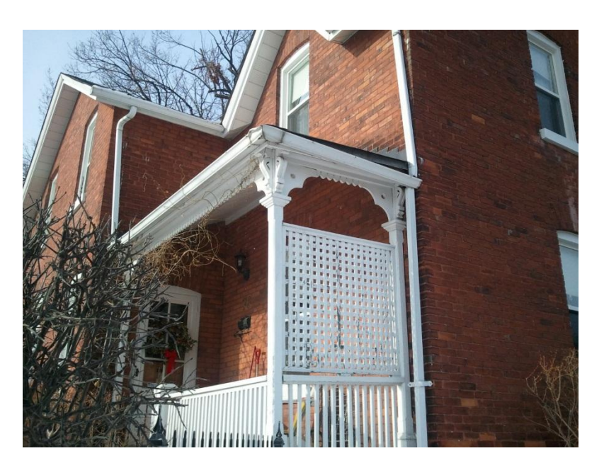
Porch, South Façade, 76 Elgin Street East, January 2013