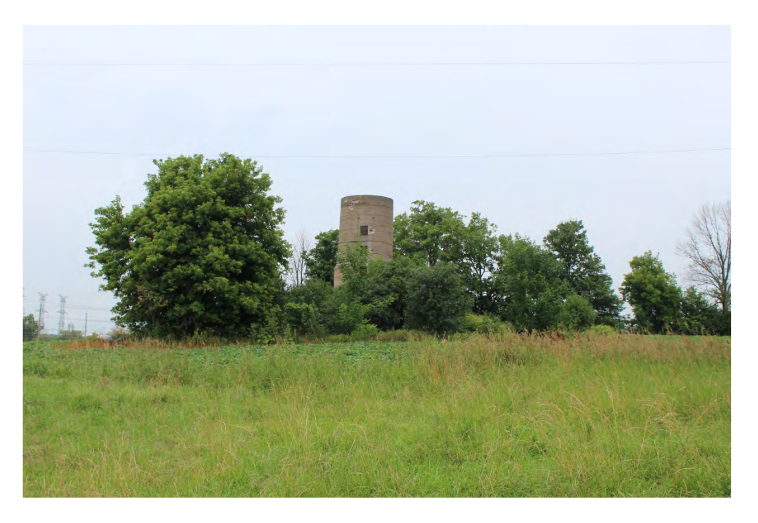
3. Silo on property, located north of the home.