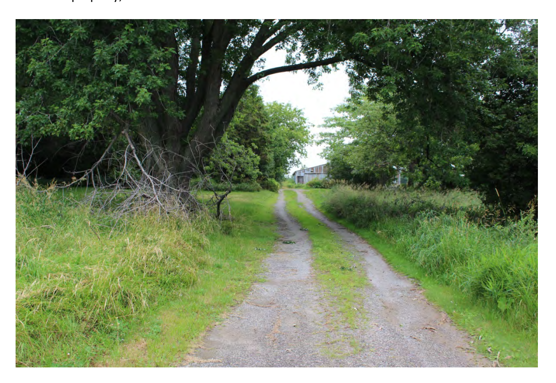
4. 2651 Harmony Road North, Driveway and outbuilding located south of the house.