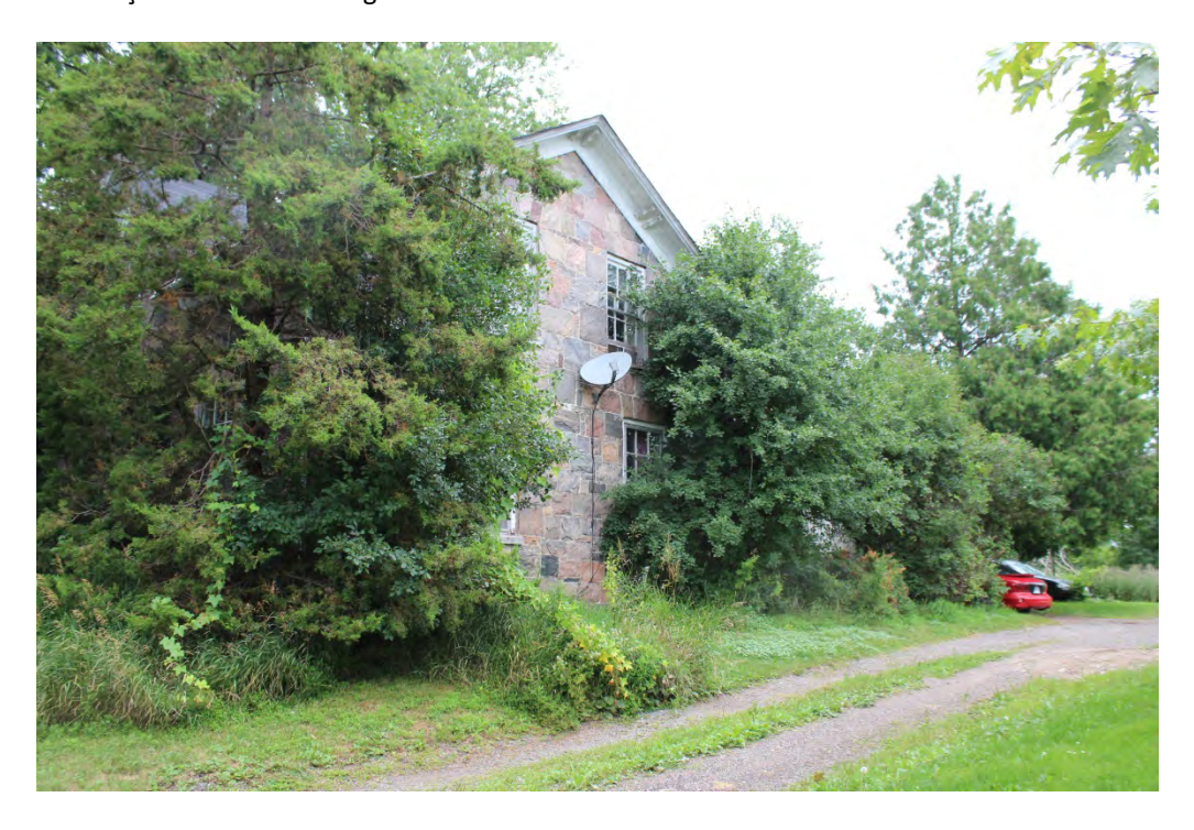
2. 2651 Harmony Road North, South Elevation