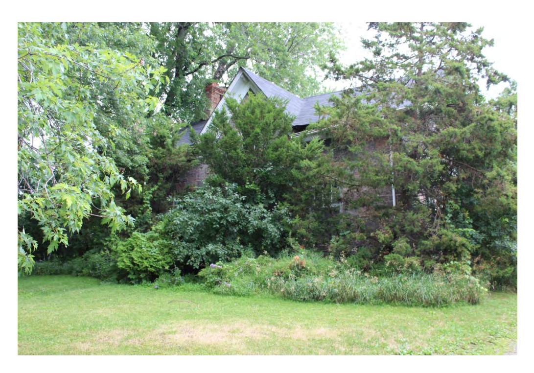
1. 2651 Harmony Road North, Front Façade, West/South Elevation. See historical photographs for an image of the front façade without the vegetation.

Due to the overgrown vegetation on the property taking photographs of the property was difficult.