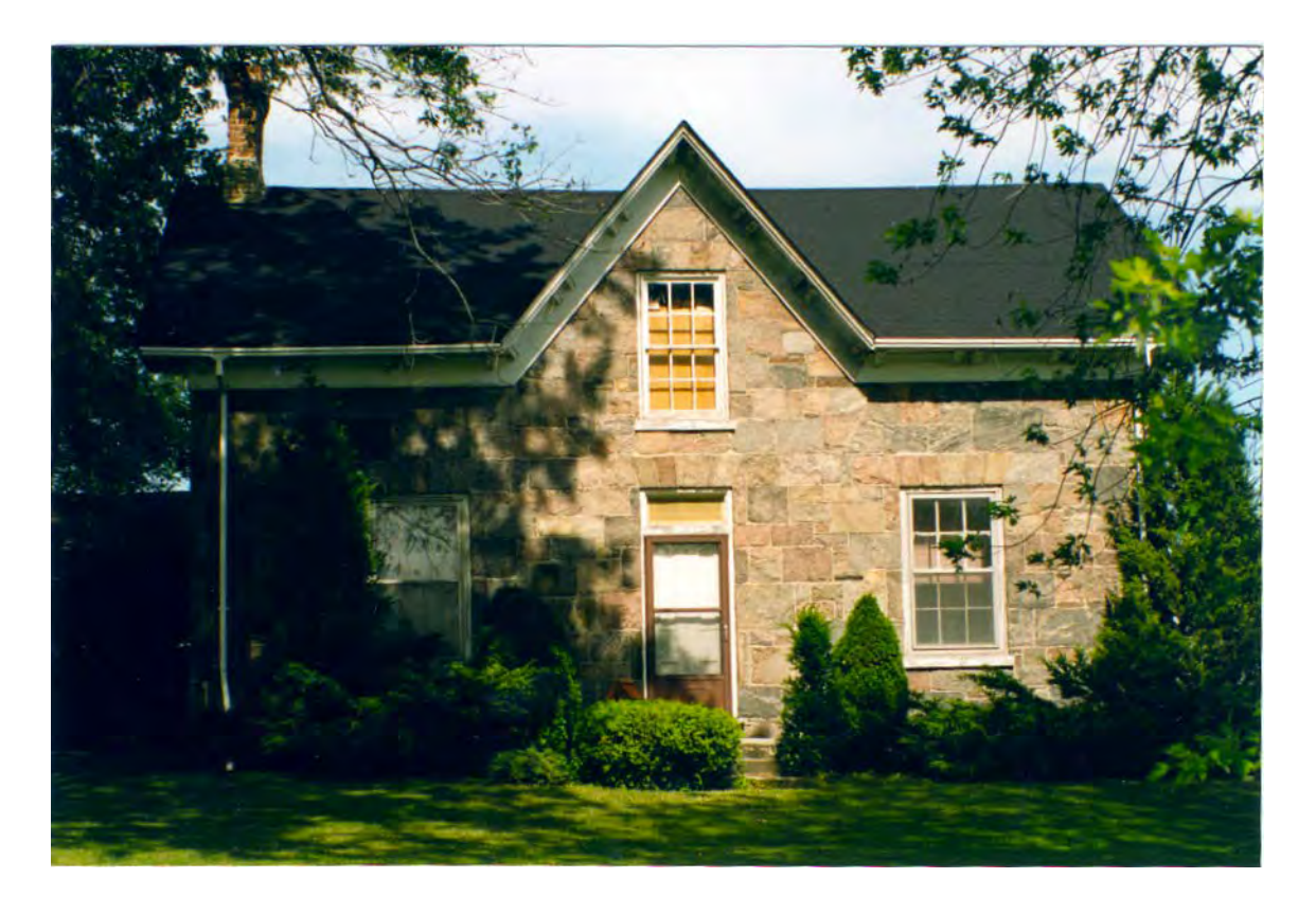
1. 2651 Harmony Road North, West Façade, May 1998.