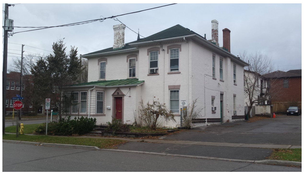
South and East Façades