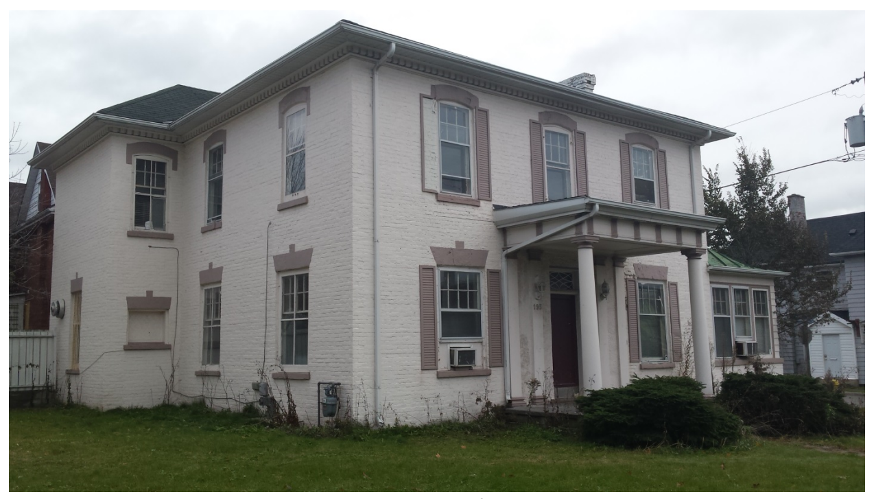
West and North façade