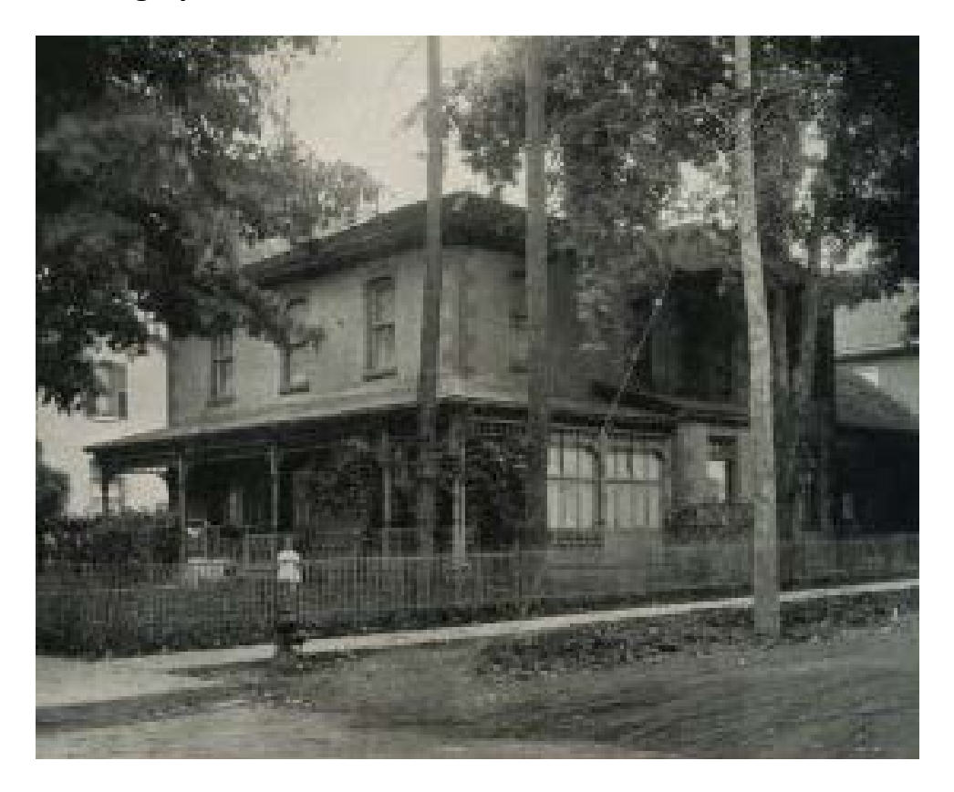
Robert McLaughlin House, West and South Façades