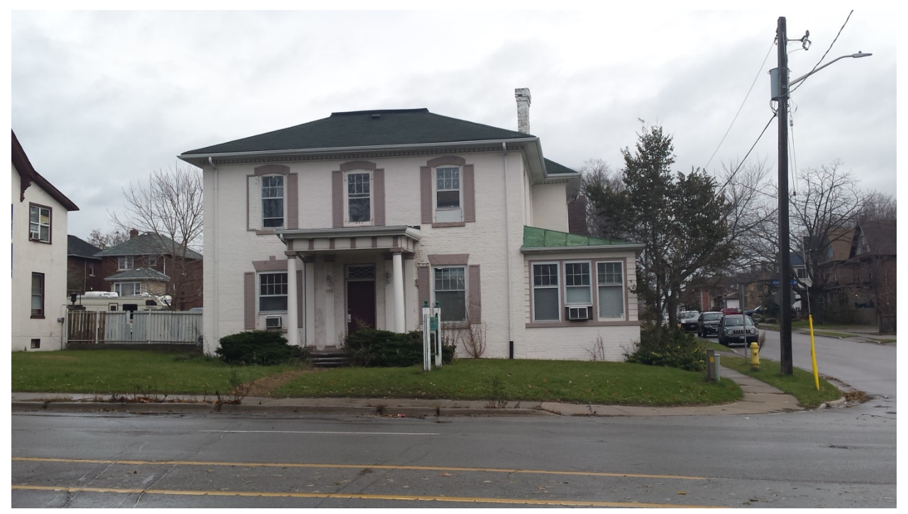
West Façade facing west onto Simcoe Street North