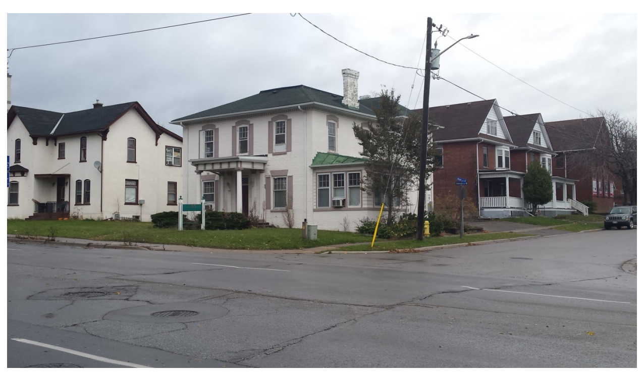
Location of the home on the northeast corner of Simcoe Street North and Elgin Street