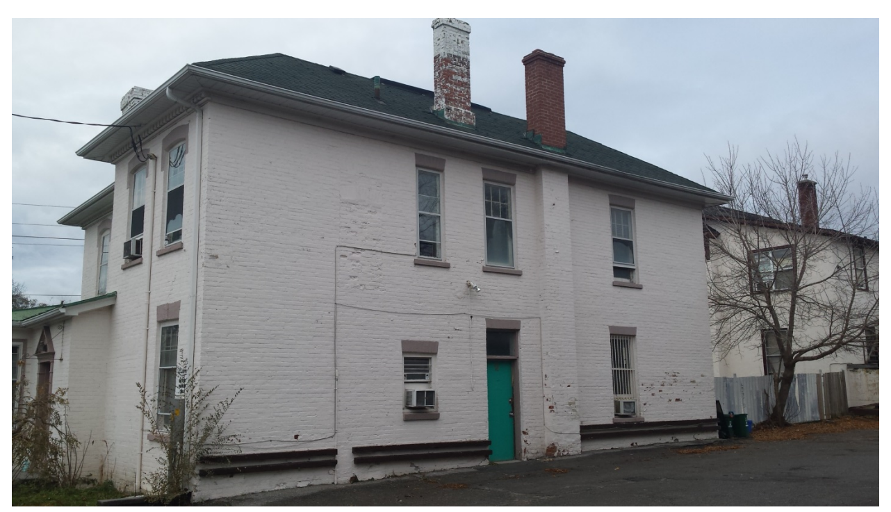
East Façade, Rear of the Building