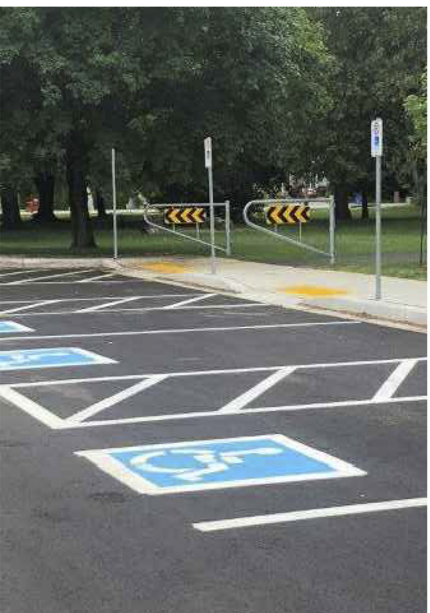
PARKING LOT UPGRADES