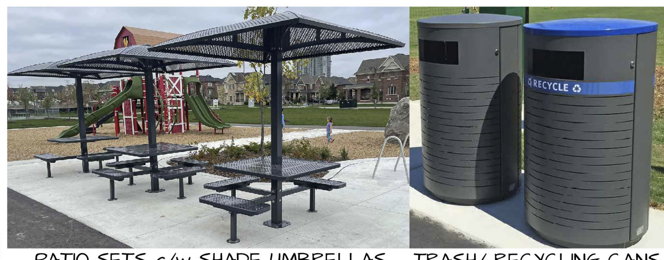
PATIO SETS c/w SHADE UMBRELLAS TRASH/ RECYCLING CANS