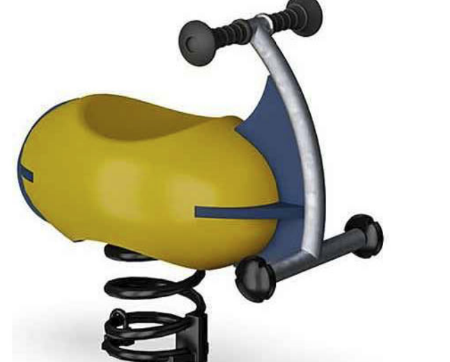
RACER SPRING TOY

FOR MORE INFORMATION, CONTACT SERVICE OSHAWA AT 905-436-3311