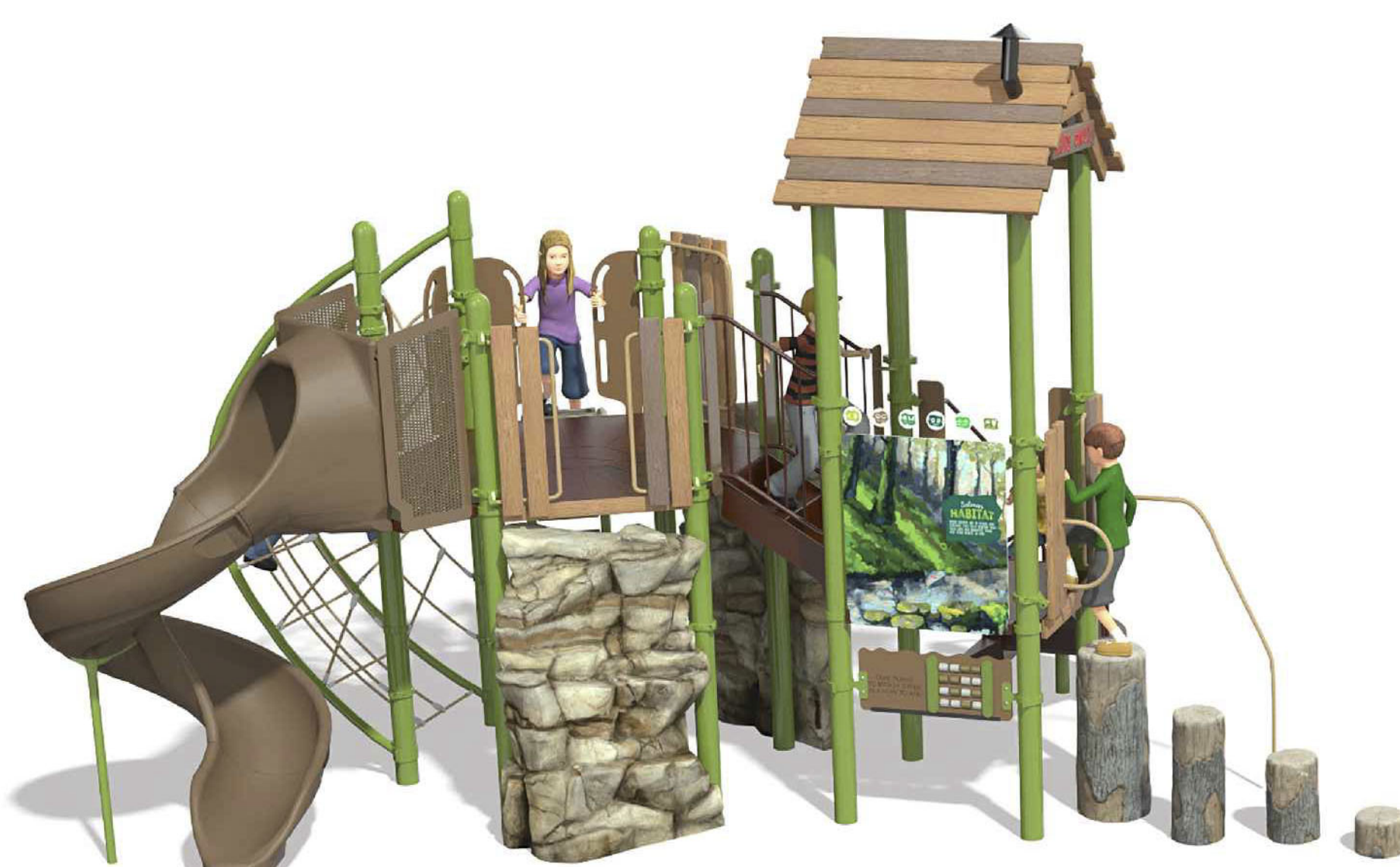
SENIOR PLAY STRUCTURE