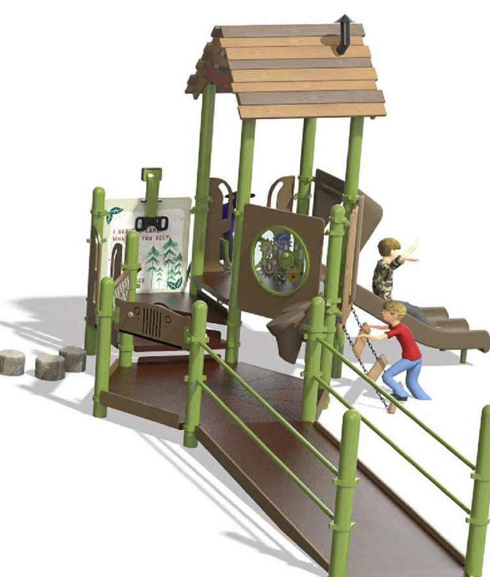
JUNIOR PLAY STRUCTURE