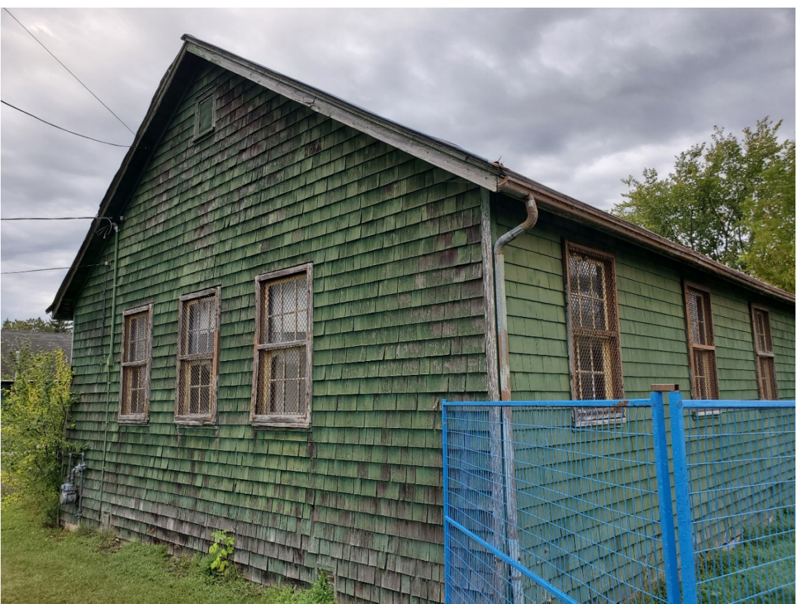
Figure 3: South and east façades of the former Canteen Building (looking northwest)