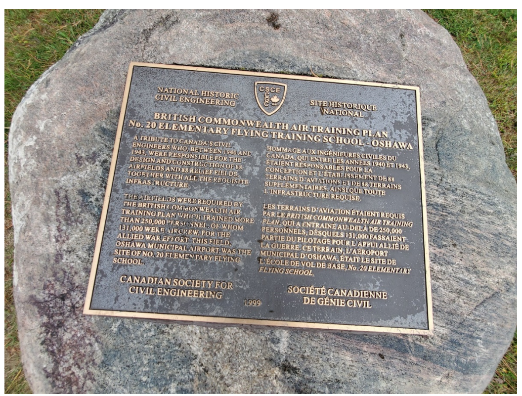
Figure 36: Airmen's Park, Canadian Society for Civil Engineering Plaque, plaque detail