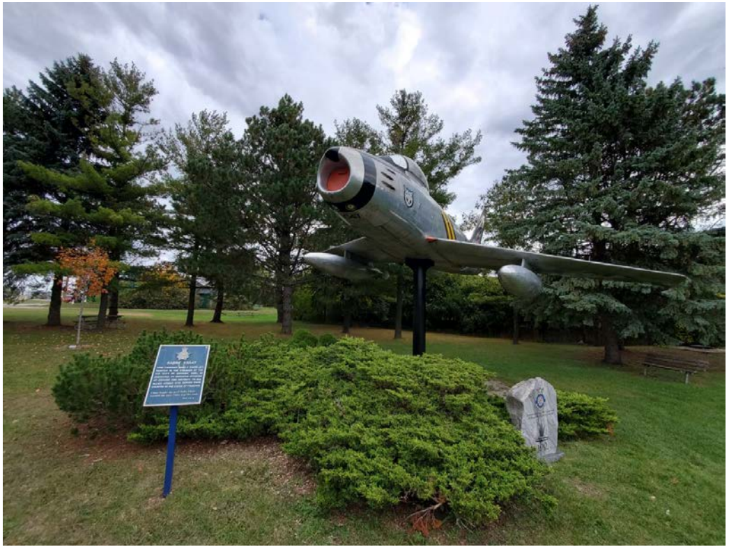
Figure 37: Airmen's Park, war surplus Sabre Jet (looking northeast)