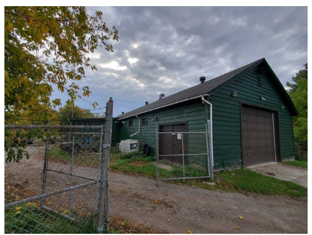
Figure 33: Former Stores Building, northwest façade, northeast facade and tank storage entry (looking southeast)