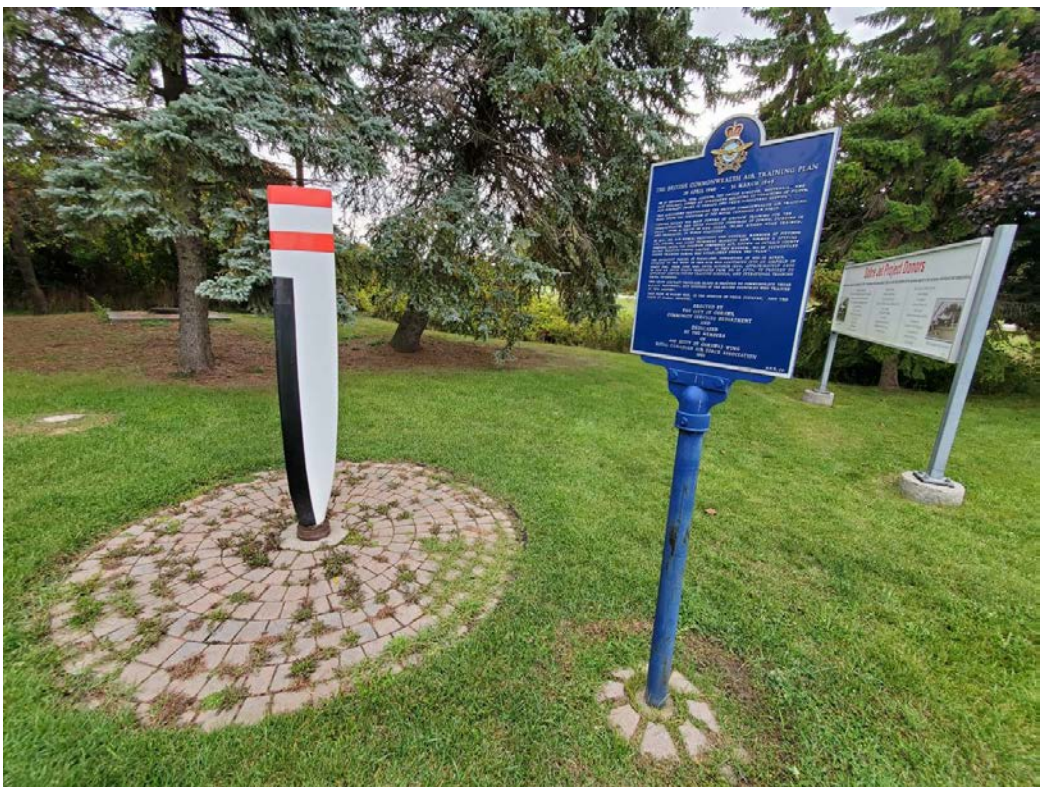
Figure 39: Airmen's Park, propeller blade, associated City of Oshawa plaque and Airmen's Park entry sign (looking northeast)