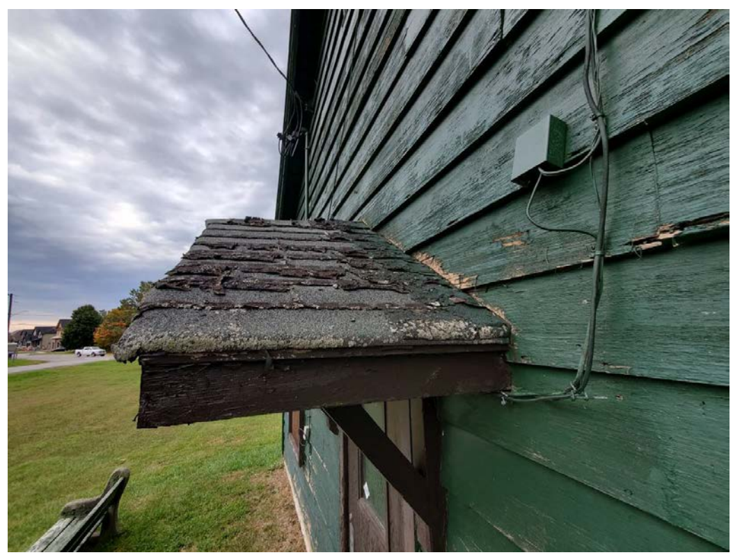
Figure 26: Former Stores Building, southeast façade (looking southwest), front entry canopy detail