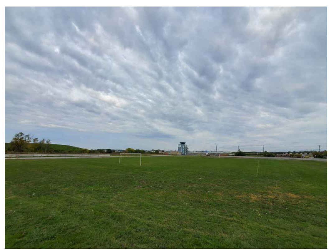
Figure 56: Airmen's Park soccer field (looking north) viewed from Stevenson Road North