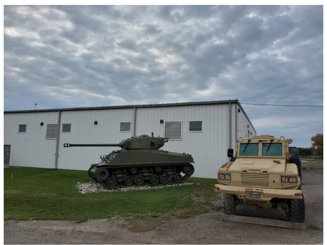
Figure 55: Ontario Regiment Museum and tanks (looking southwest) viewed from Stevenson Road North