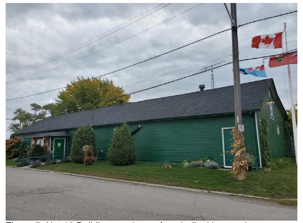
Figure 7: No. 10 Building, northwest façade (looking east)