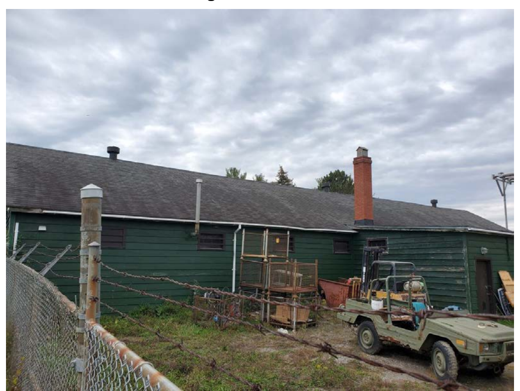
Figure 21: Former Stores Building, northeast façade and tank storage area (looking southwest)