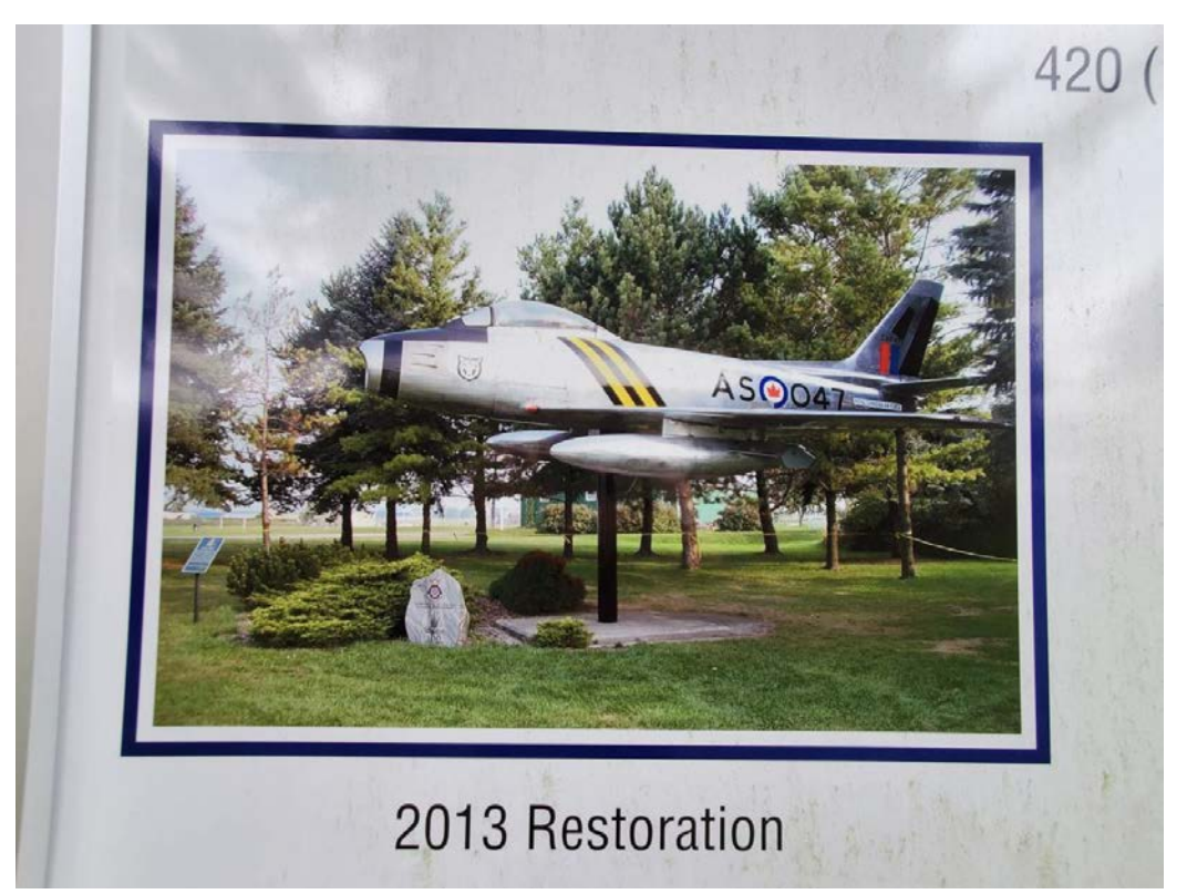
Figure 44: Airmen's Park, Airmen's Park entry sign, sign detail showing 2013 Sabre Jet restoration