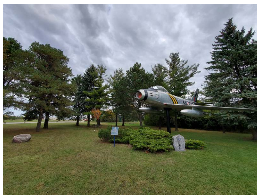
Figure 47: Airmen's Park, war surplus Sabre Jet and surrounding foliage (looking northeast)