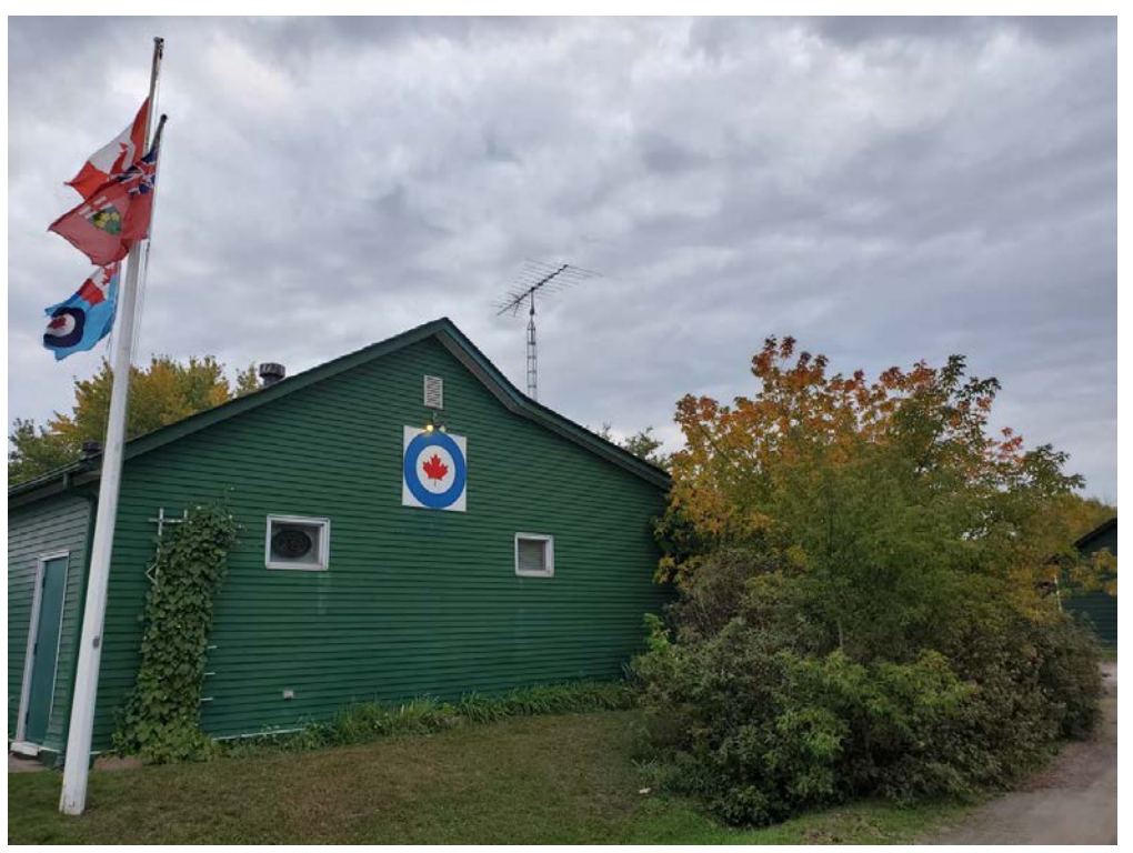
Figure 6: No. 10 Building, southwest façade (looking northeast)