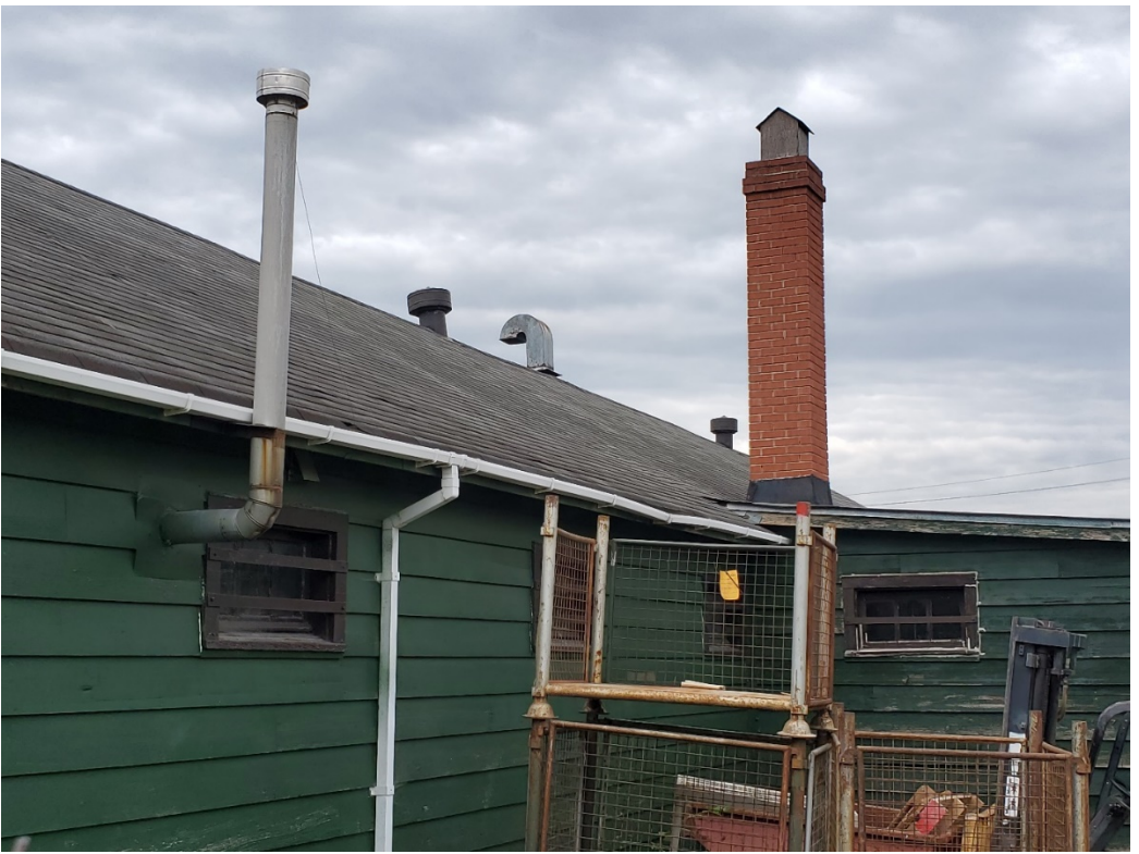
Figure 23: Former Stores Building, northeast façade (looking southwest), window detail