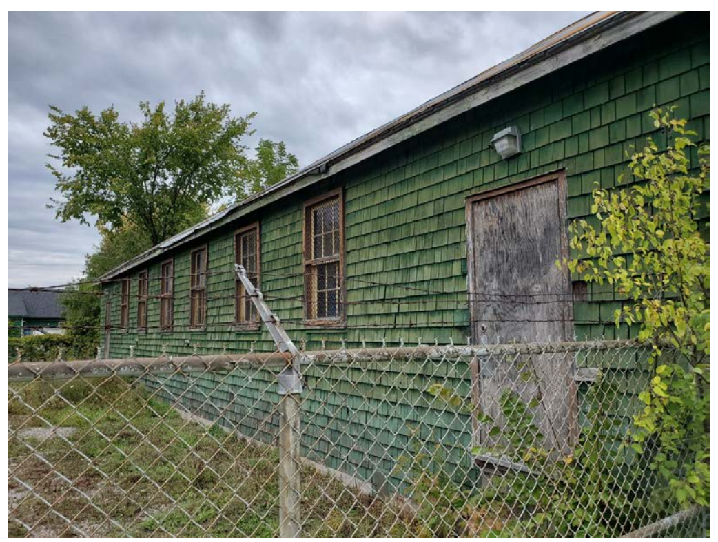
Figure 20: Former Canteen Building, southwest façade (looking northwest)