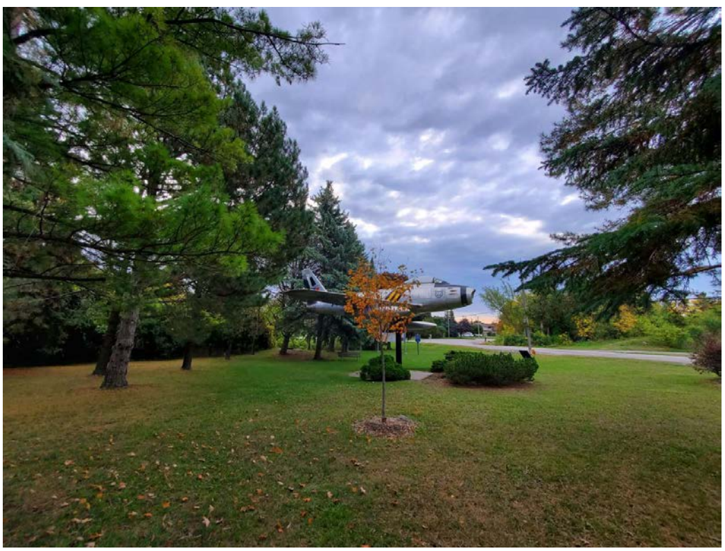
Figure 34: Airmen's Park (looking south)