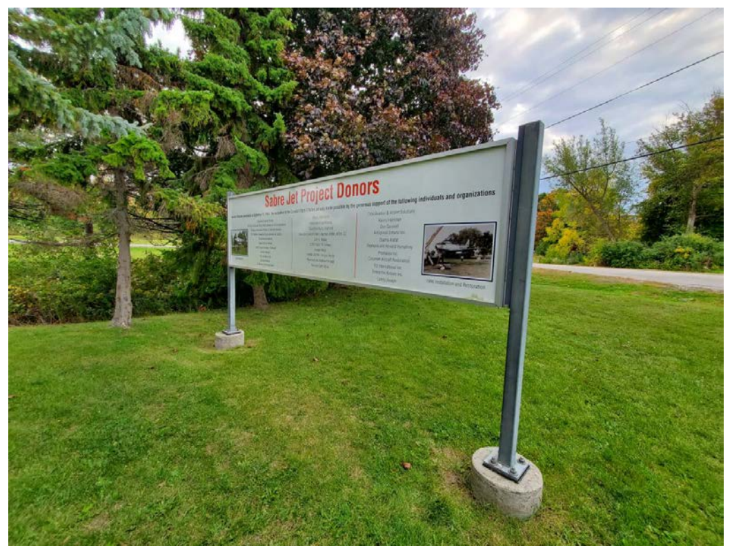
Figure 41: Airmen's Park, Airmen's Park entry sign (looking southeast)