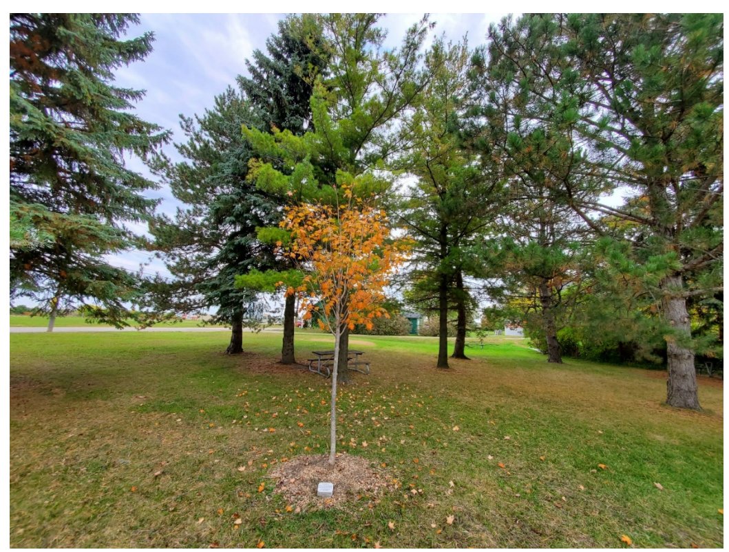
Figure 48: Airmen's Park, Fl Lt. H. Armour Hanna tree dedication (looking north)