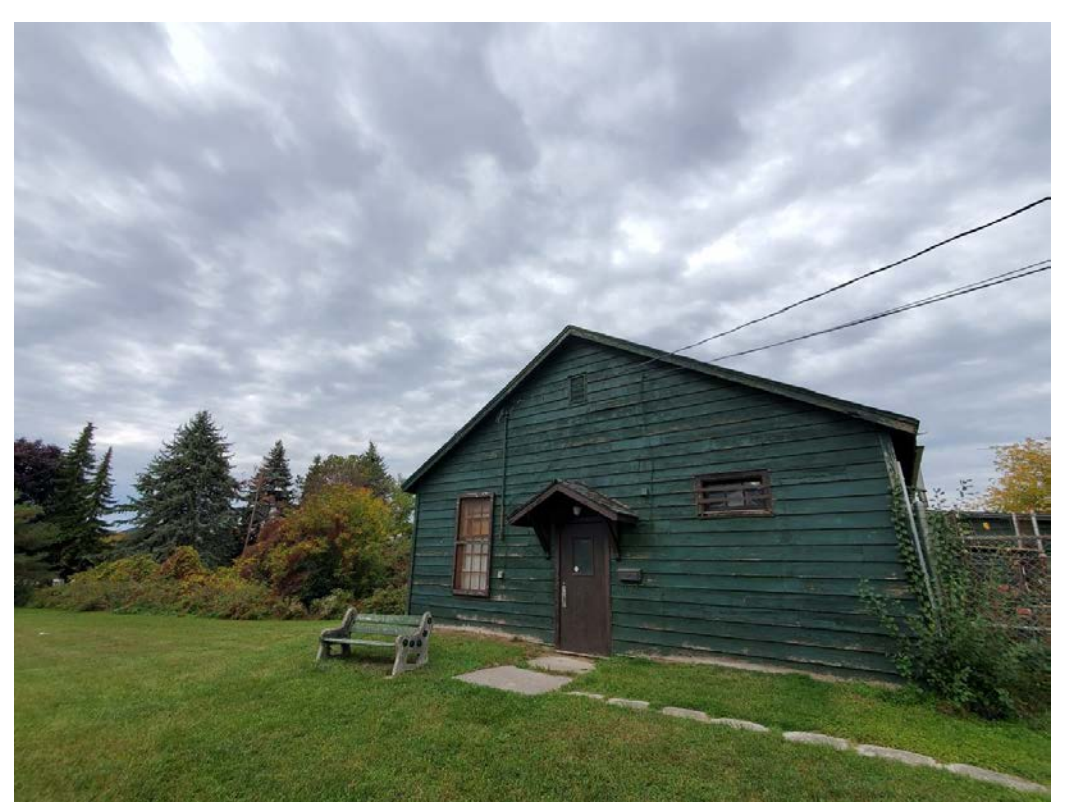
Figure 24: Former Stores Building, southeast façade (looking west), Airmen's Park to left