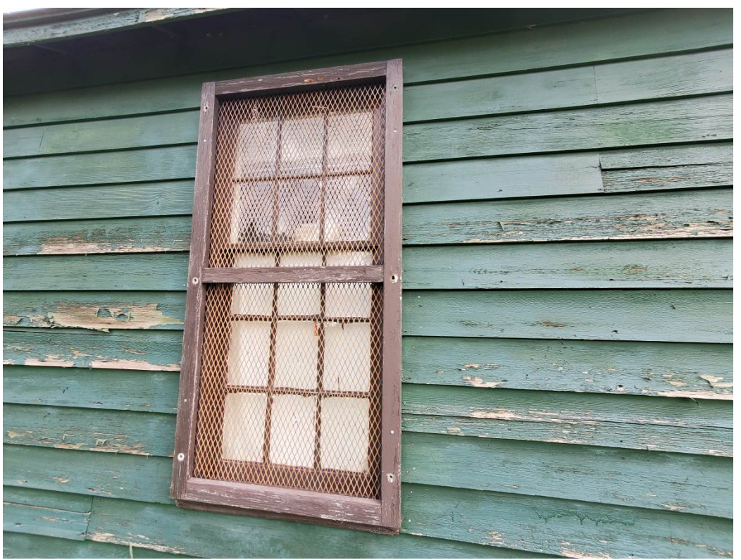
Figure 28: Former Stores Building, southwest façade (looking north), window detail