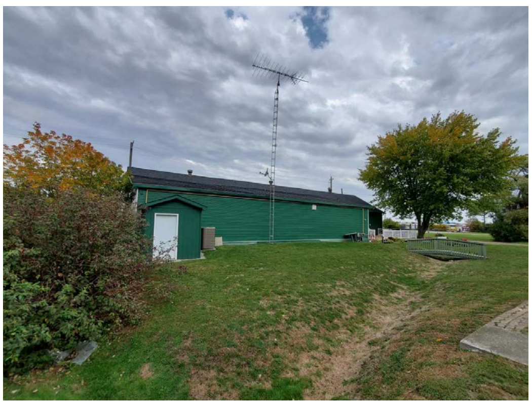
Figure 12: No. 10 Building, southeast façade (looking north)