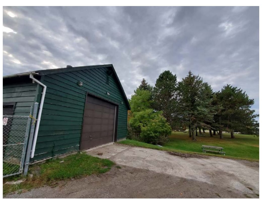
Figure 32: Former Stores Building, northwest façade (looking south), Airmen's Park to right