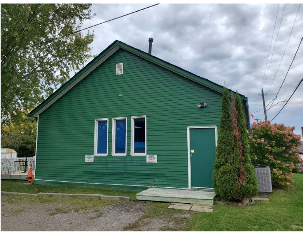
Figure 10: No. 10 Building, northeast façade (looking southwest)