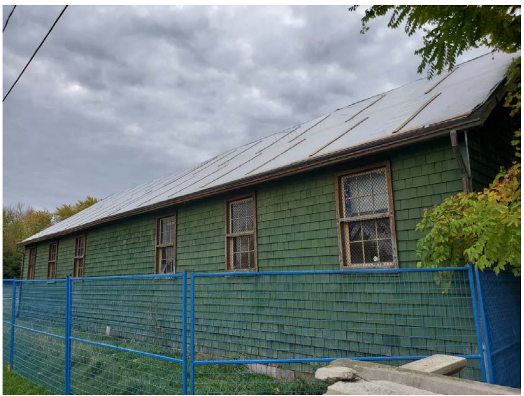
Figure 14: Former Canteen Building, northeast façade (looking south)