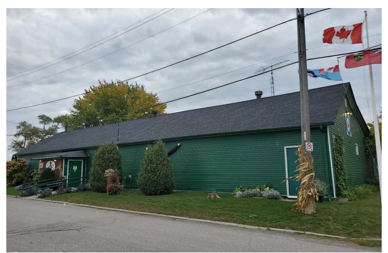
Figure 1: The No. 10 Building, currently a Class A property on the Heritage Oshawa Inventory

Heritage Oshawa has identified the following in the area immediately adjacent to the Study Area and within the South Field: