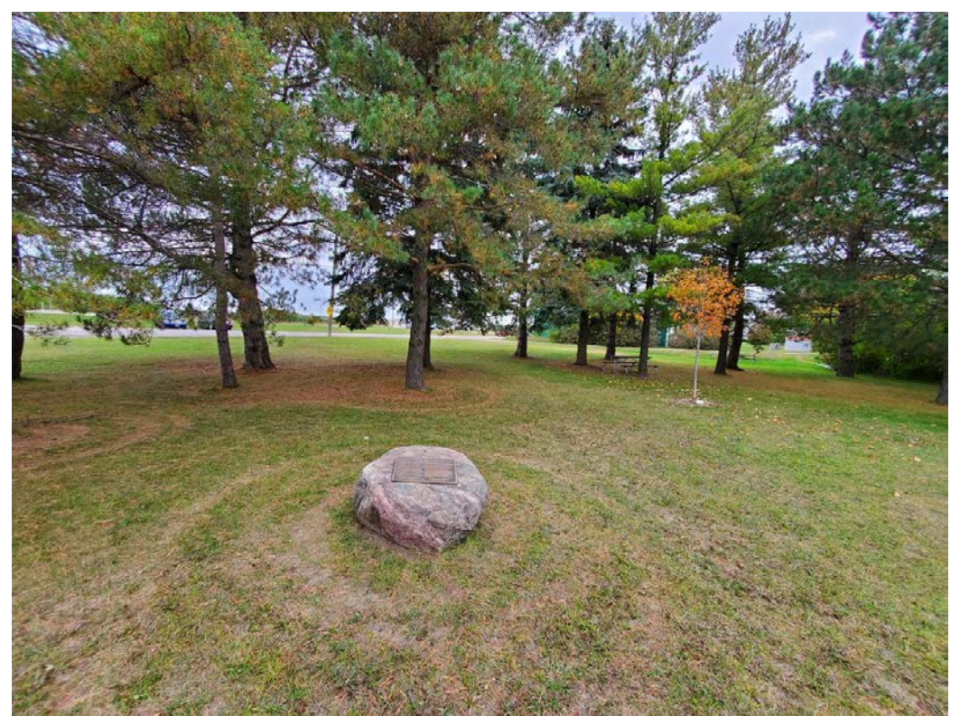
Figure 35: Airmen's Park, Canadian Society for Civil Engineering Plaque (looking north)