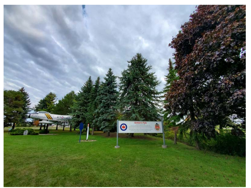
Figure 45: Airmen's Park, propeller blade, associated City of Oshawa plaque, Airmen's Park entry sign, and war surplus Sabre Jet (looking northwest)