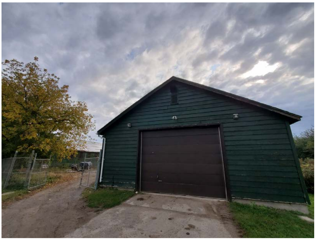
Figure 31: Former Stores Building, northwest façade and tank storage entry (looking east)