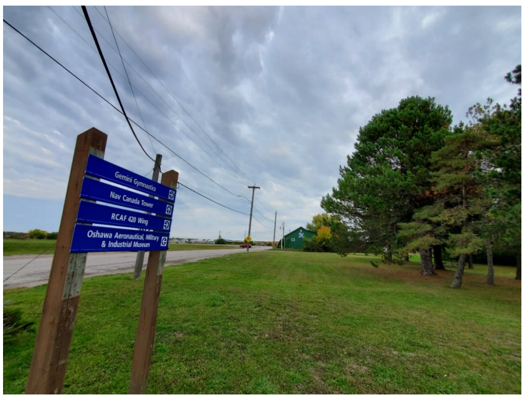
Figure 51: Airmen's Park and southwest façade of No. 10 Building (looking northeast), Chick Hewett Lane to left