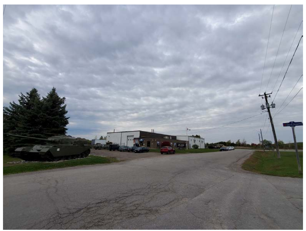
Figure 52: Ontario Regiment Museum and Stevenson Road North (looking west) viewed from west corner of Airmen's Park