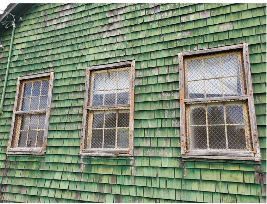
Figure 18: Former Canteen Building, southeast façade (looking northwest), window detail