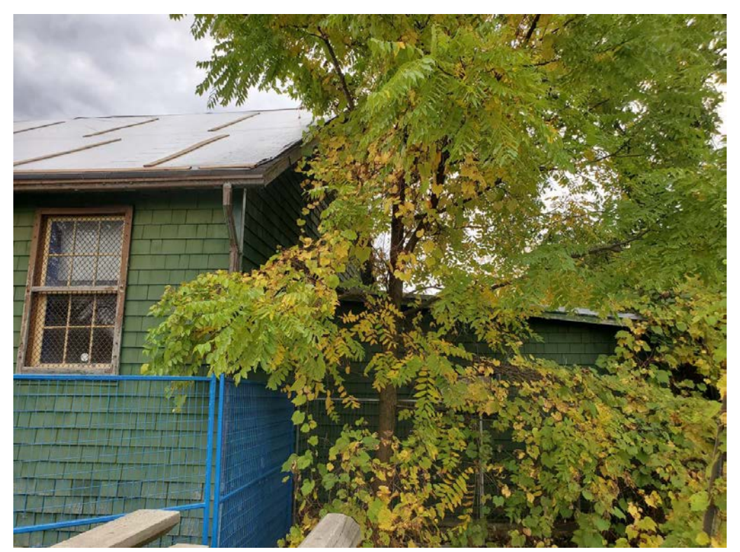
Figure 15: Former Canteen Building, northeast façade, northwest façade, and northwest addition (looking southwest)