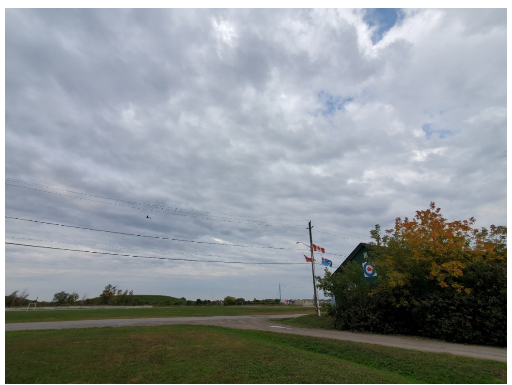
Figure 50: Airmen's Park and southwest façade of No. 10 Building (looking northwest), Chick Hewett Lane and Airmen's Park soccer field to left