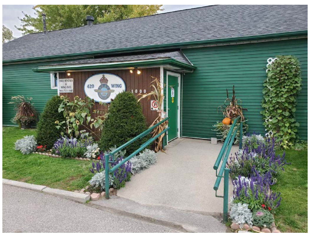
Figure 8:No. 10 Building, northwest façade (looking east), front entry