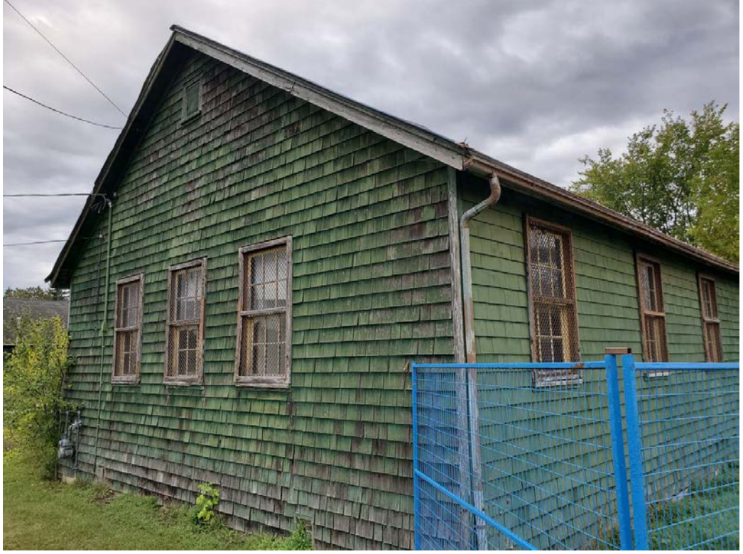
Figure 17: Former Canteen Building, northeast and southeast façade (looking west)