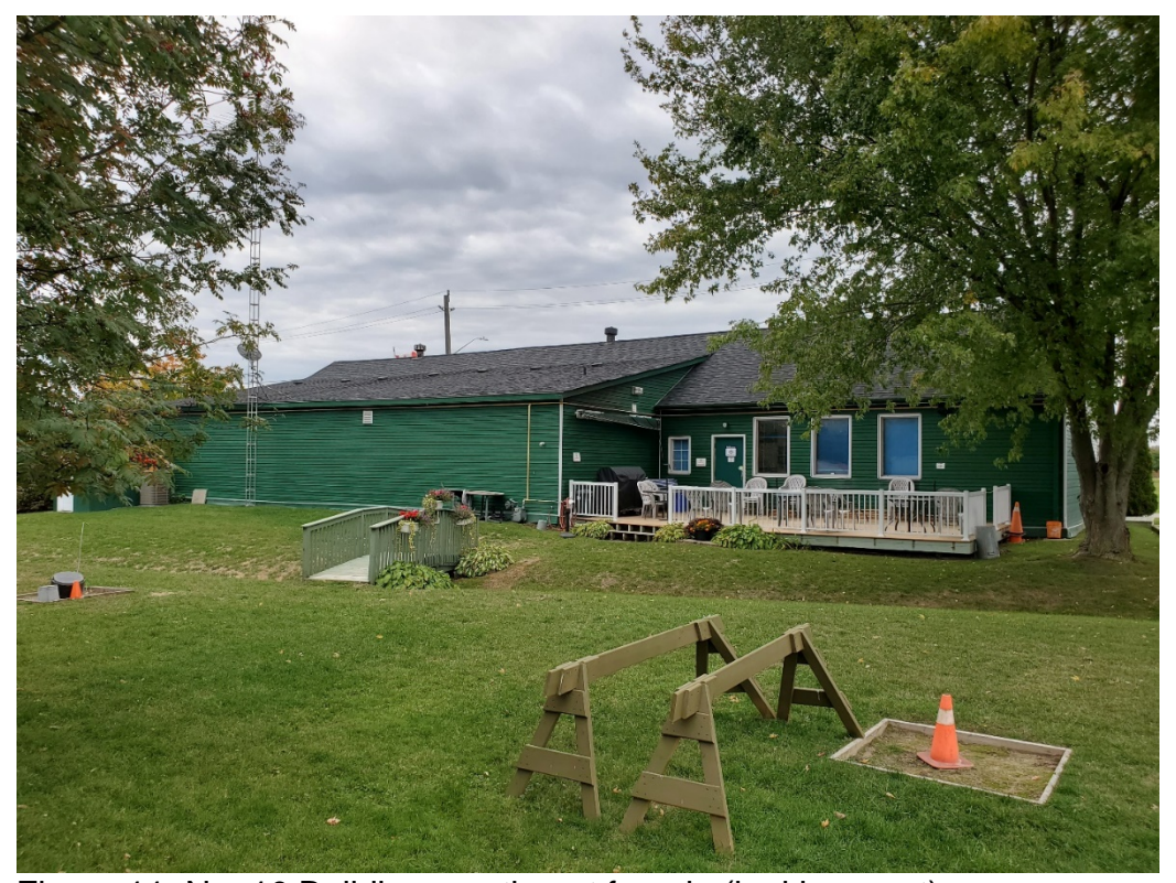
Figure 11: No. 10 Building, southeast façade (looking west)