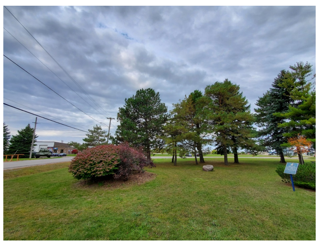
Figure 46: Airmen's Park and surrounding foliage (looking west), Ontario Regiment Museum and Stevenson Road North to left