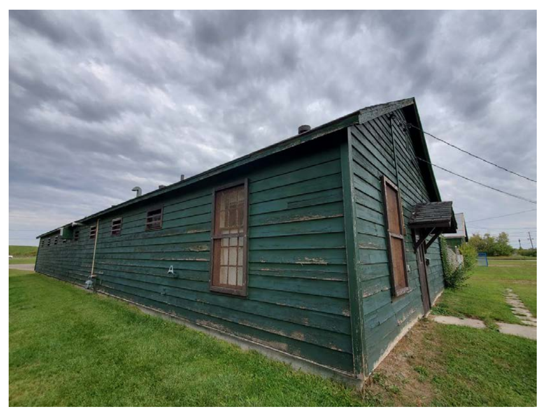
Figure 27: Former Stores Building, southeast and southwest façade (looking north)