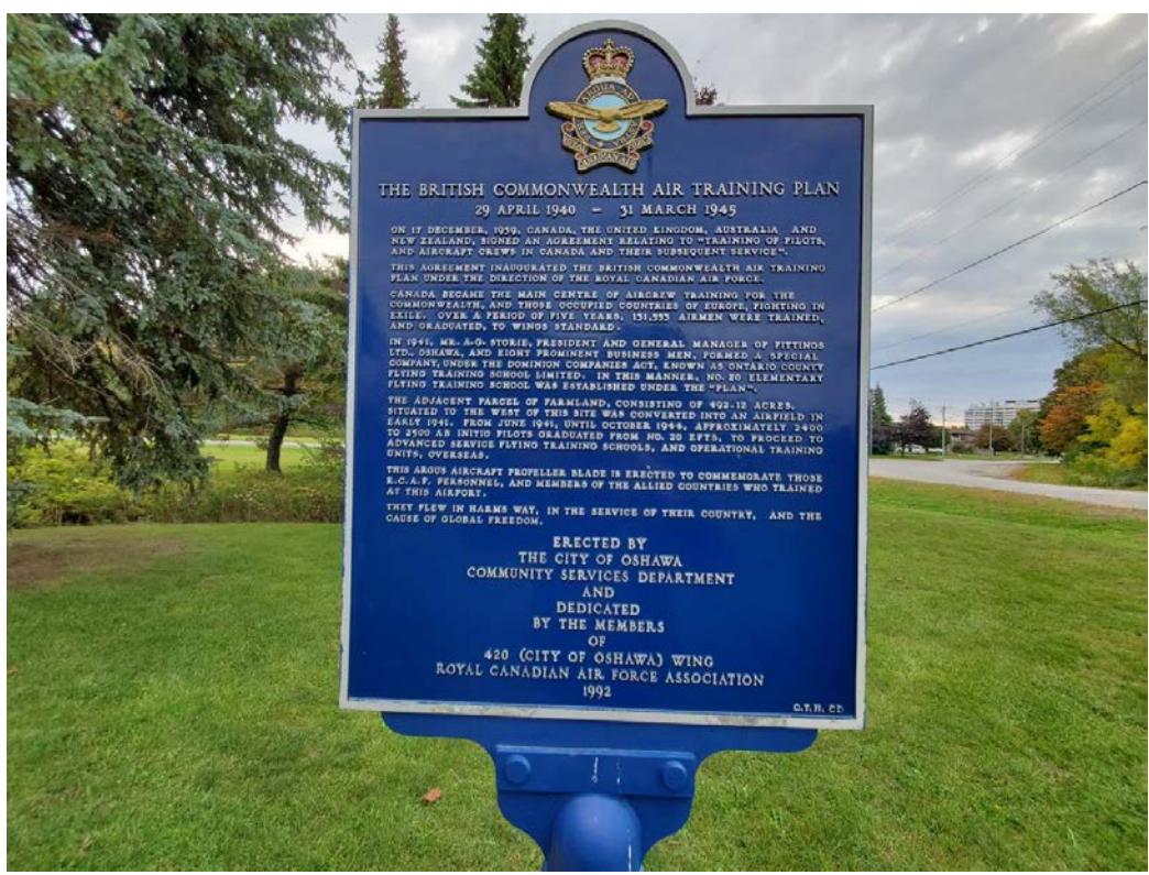
Figure 40: Airmen's Park, City of Oshawa plaque, plaque detail