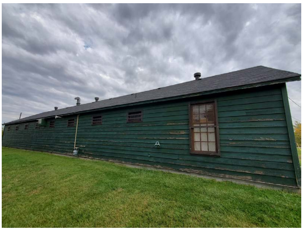
Figure 29: Former Stores Building, southwest façade (looking northeast)