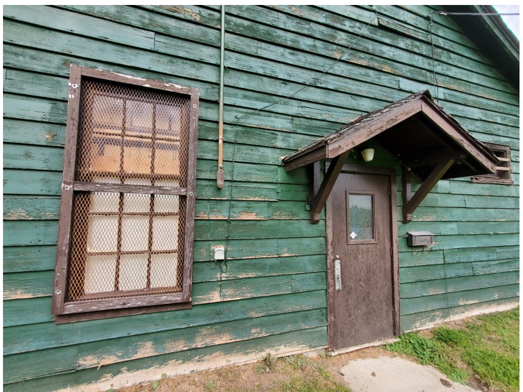
Figure 25: Former Stores Building, southeast façade (looking northwest), front entry