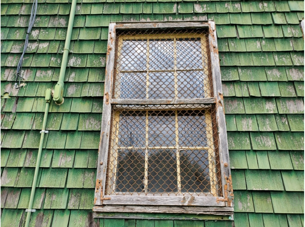
Figure 19: Former Canteen Building, southeast façade (looking northwest), window detail