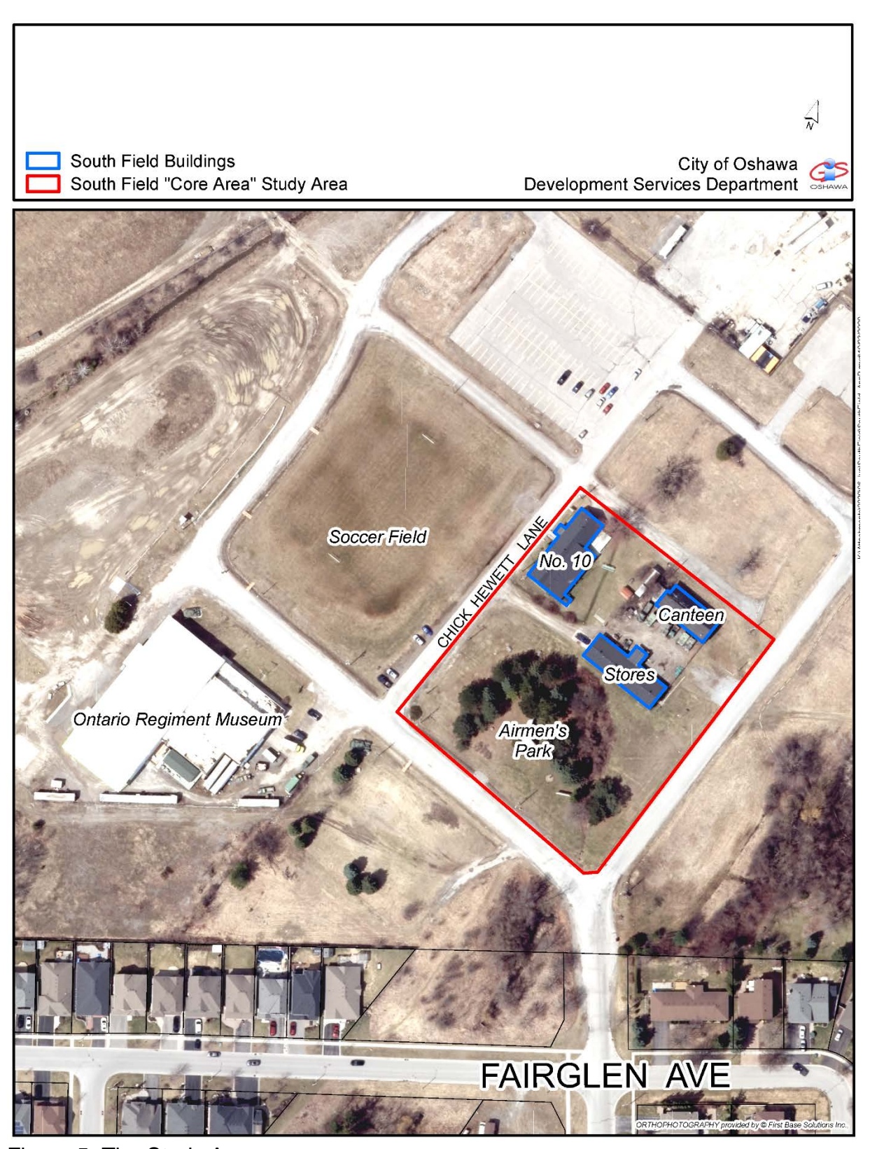
Figure 5: The Study Area