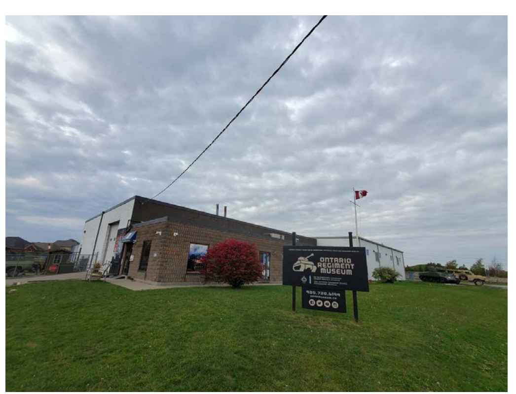
Figure 54: Ontario Regiment Museum (looking southwest) viewed from Stevenson Road North