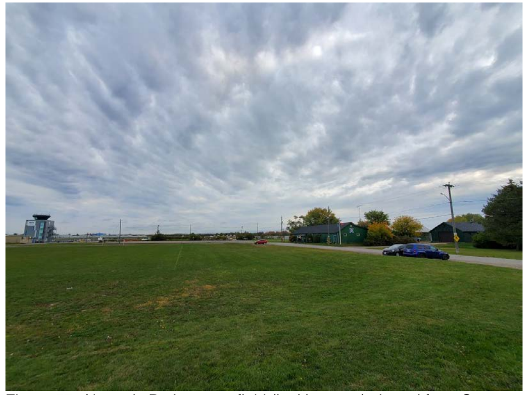
Figure 57: Airmen's Park soccer field (looking east) viewed from Stevenson Road North