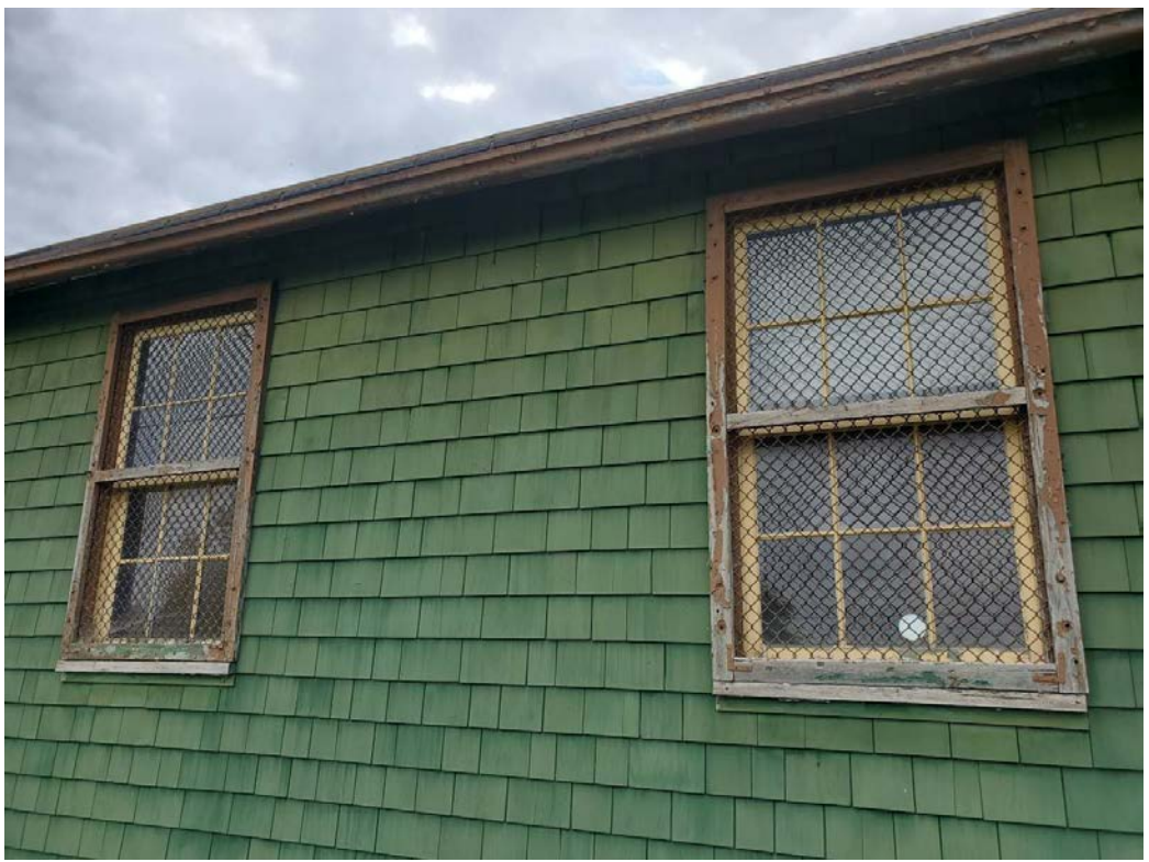
Figure 16: Former Canteen Building, northeast façade (looking south), window detail