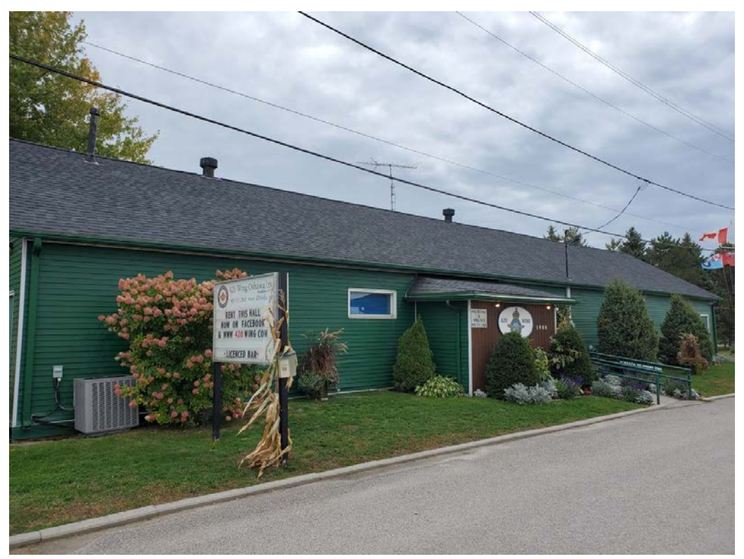
Figure 9: No. 10 Building, northwest façade (looking southeast)