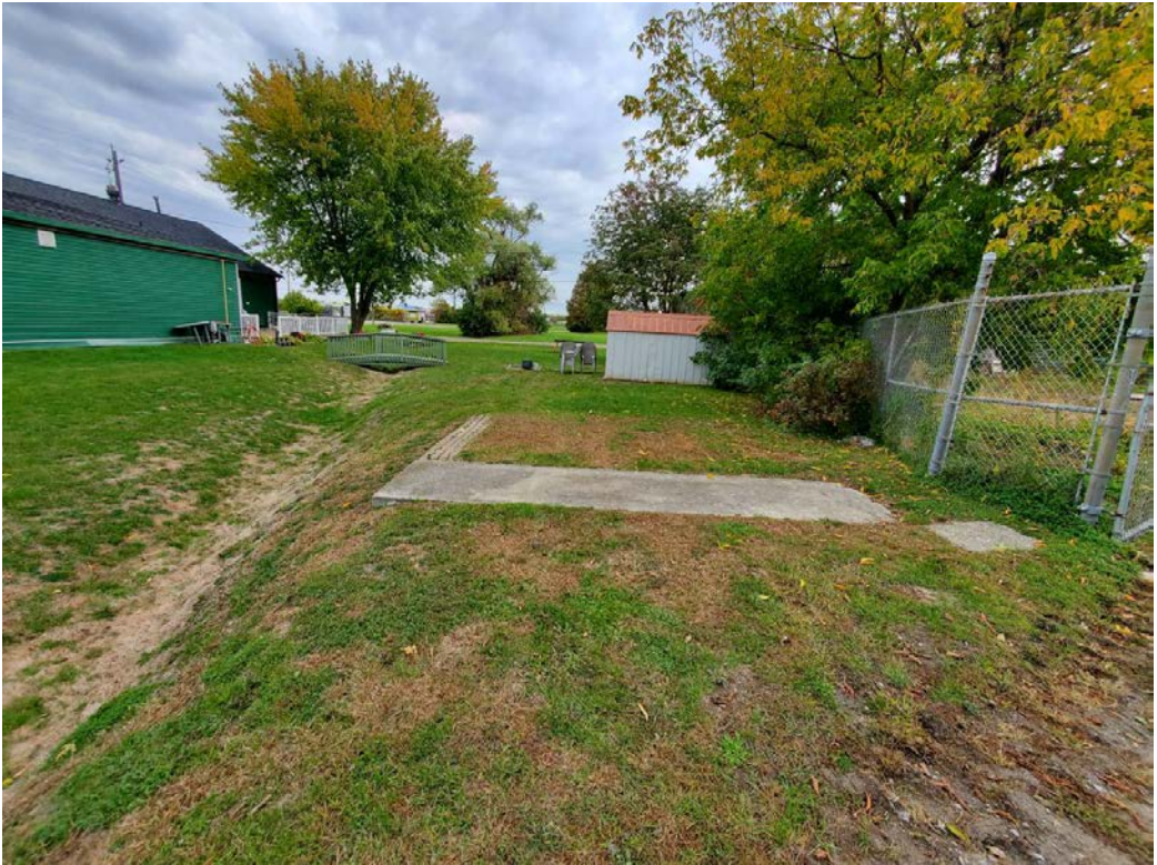
Figure 13: No. 10 Building, southeast façade and rear yard area (looking northeast)