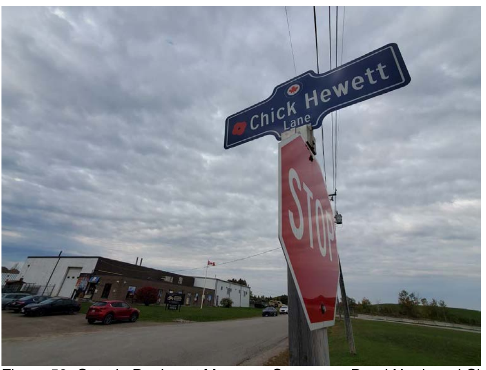
Figure 53: Ontario Regiment Museum, Stevenson Road North and Chick Hewett Lane sign (looking west) viewed from west corner of Airmen's Park