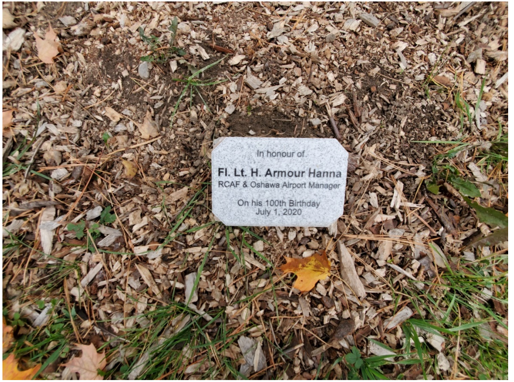
Figure 49: Airmen's Park, FI Lt. H. Armour Hanna tree dedication, stone detail