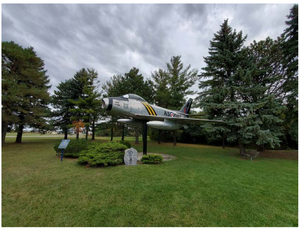
Figure 38: Airmen's Park, war surplus Sabre Jet and surrounding foliage (looking north)