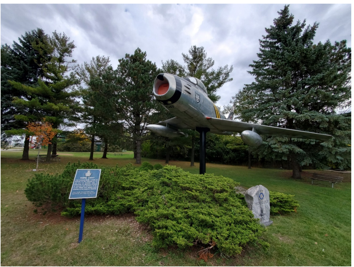
Figure 4: View of war surplus Sabre Jet and surrounding landscaping in Airmen's Park