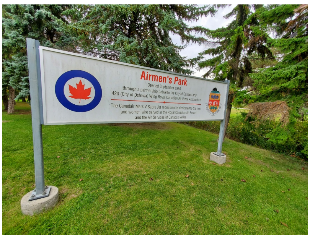
Figure 42: Airmen's Park, Airmen's Park entry sign (looking north)