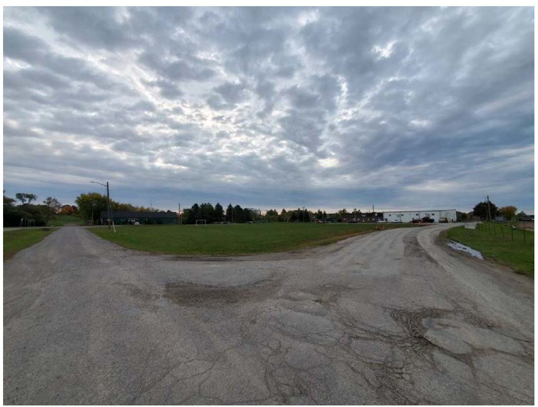
Figure 58: Airmen's Park soccer field and road grid (looking southeast)