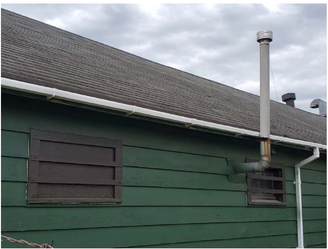
Figure 22: Former Stores Building, northeast façade (looking southwest), window detail