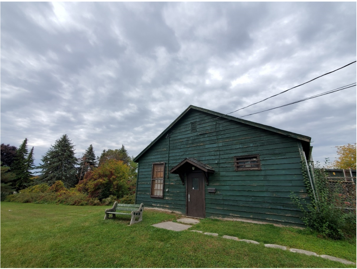
Figure 2: Front (south) facade of the former Stores Building (looking north)