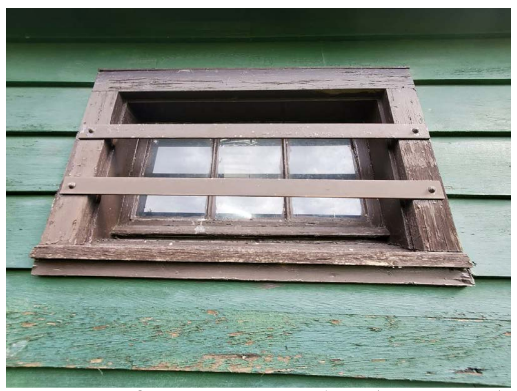
Figure 30: Former Stores Building, southwest façade (looking northeast), window detail