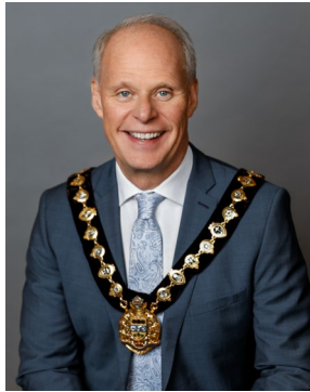
OSHAWA ONTARIO, CANADA