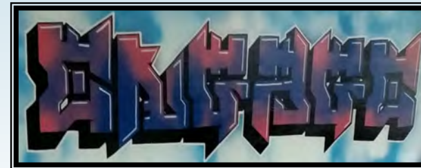
The graffiti script on Urban Art for Social Change's piano at South Oshawa Community Centre.