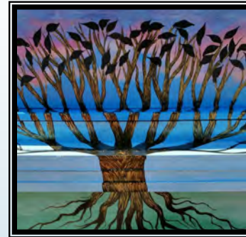
The tree illustration on Monique Ra Brent's piano at City Hall.